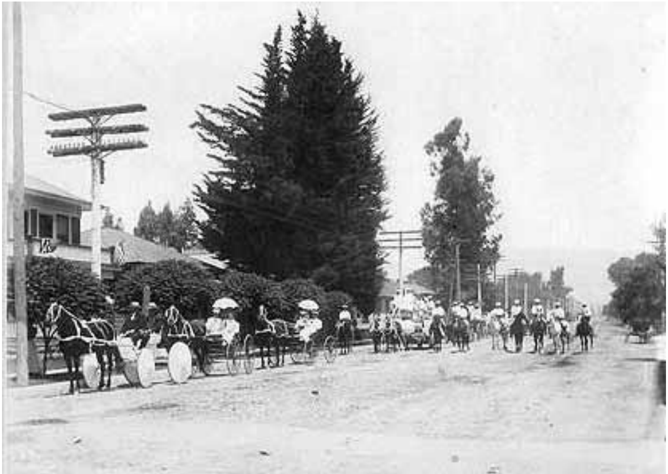
Oehl Meat Packing Company was an entrant in the San Bernardino Valley Centennial Parade – May 1910. Shown in this photograph is just part of the Oehl company's parade entry, which consisted of fifteen wagons, one float and horseback riders. Note that all the men aboard the large wagon and those on horseback are sporting the traditional meat cutter's white cap, which many real butchers in markets still wear.

Saving the past for the future since 1888