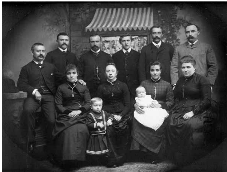
Oehl family reunion in New York – 1888.