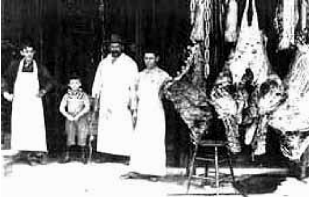
Oehl's Meat Market – 1902