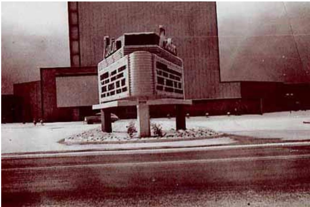
The marquee shows the movies “California,” released in 1946, and “House Across the Bay,” which came out in 1940