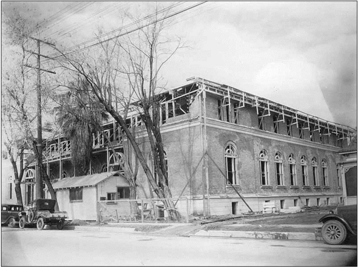
Work nears completion. February 5, 1931.