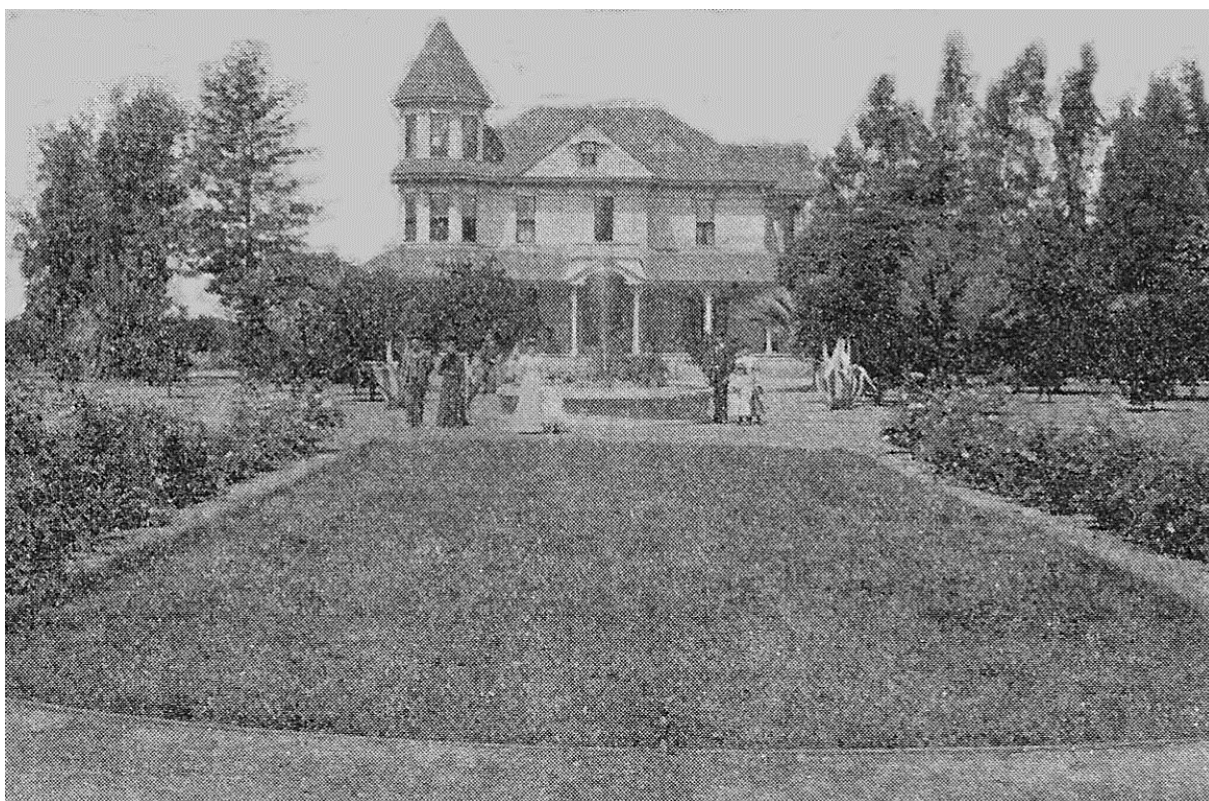
Pierson home at Idlewild