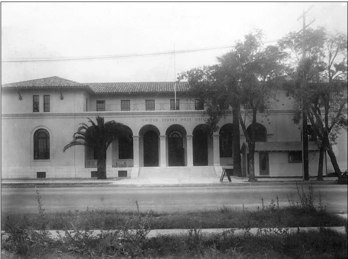
Finished post office building. June 5, 1931.