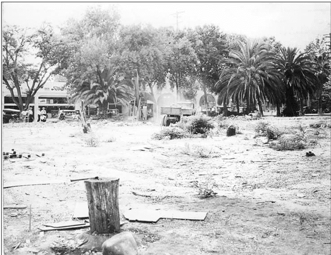
Clearing the land. August 1, 1930.