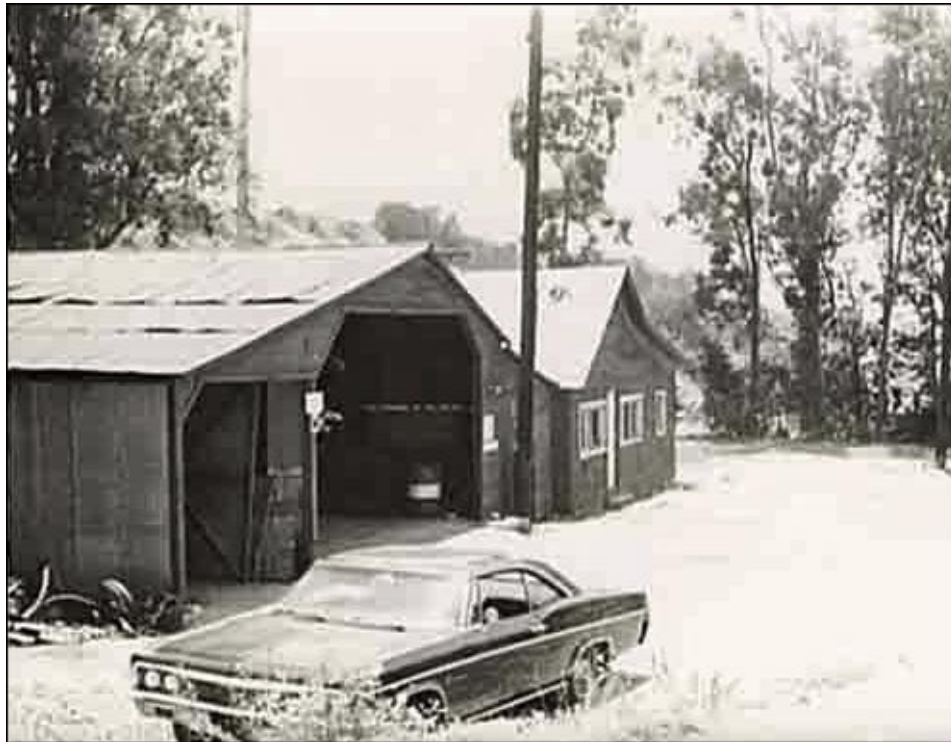
Look at that car!! My 1966 Chevrolet two-door Impala at the old cafe and garage at Cozy Dell — 1973

The garage enclosed an old barn (Bill thought it dated all the way back to the toll road days of the 1870s). In the 1920s the old highway ran right through the center of the property, between the cafe/garage on the one side and the residence on the other—"Like it was right out of Old Mexico," Bill said. The wooden buildings were razed by a later owner, and the two-story house built by the Roesch family was burned down in a large fire, so there is little, if anything, to memorialize the old site.