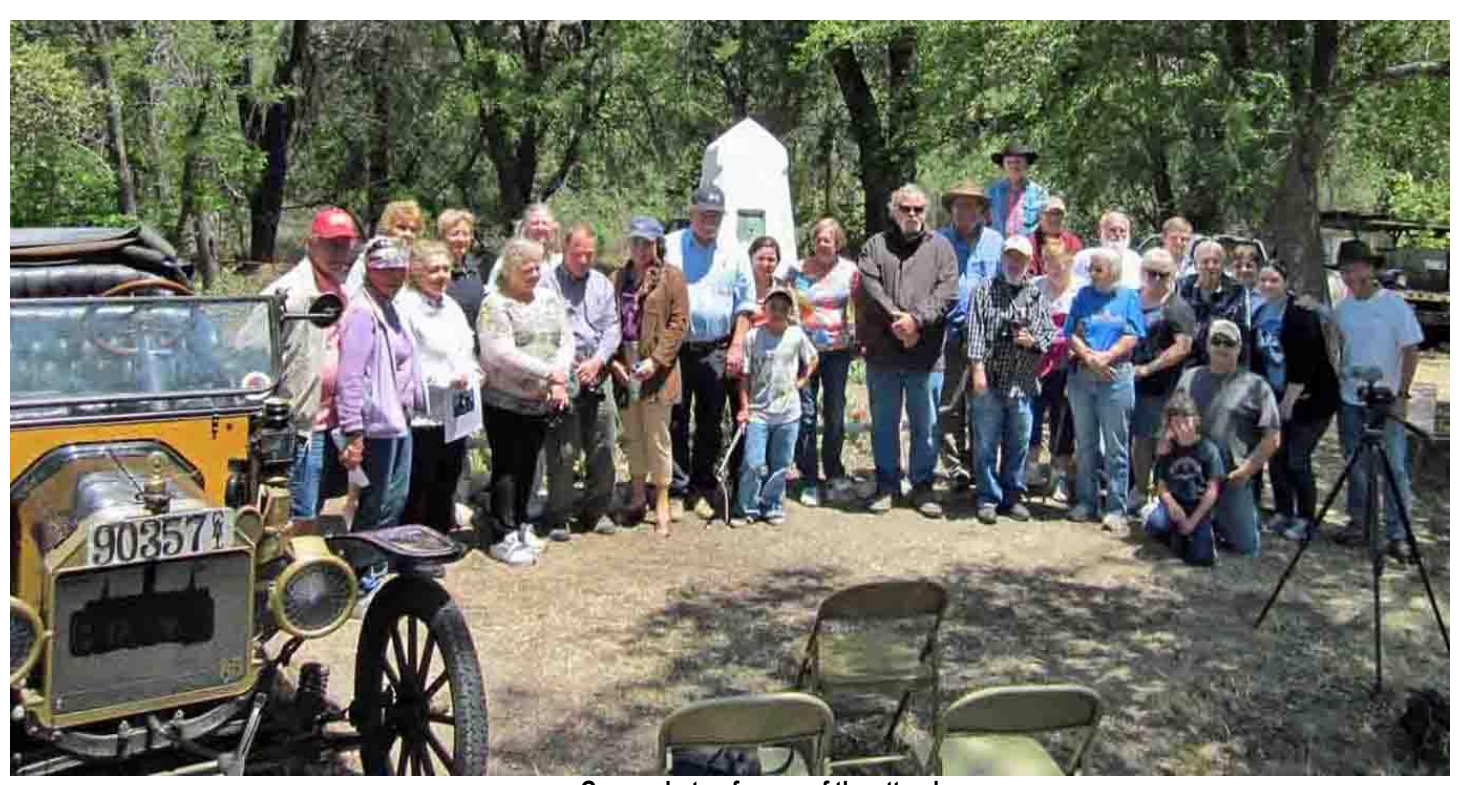
Group photo of some of the attendees