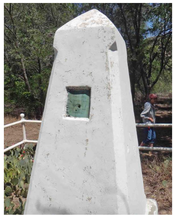
Photographs taken May 18, 2013