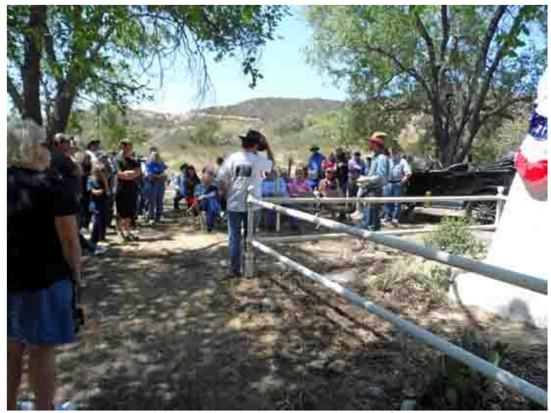
We had a great turnout and the weather was perfect