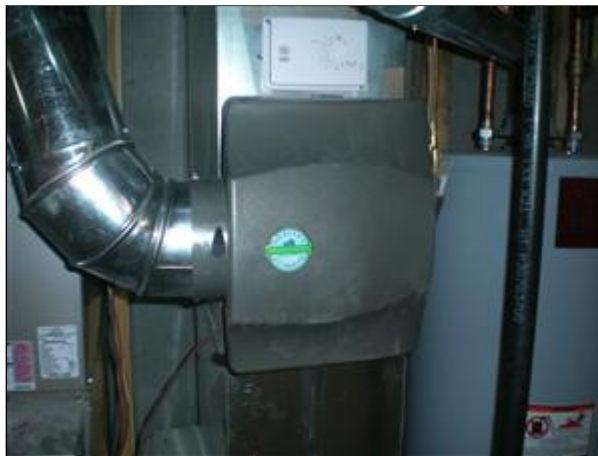
8.11 Picture 1

Make sure to change the filter several times during the winter when in use. Unit should be turned on in the winter and off in the summer.