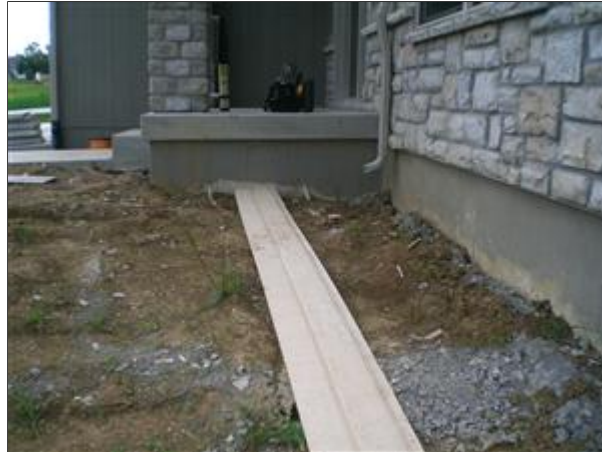
2.4 Picture 1

To insure proper drainage from house and to protect the foundation, slope from house should be at least 1" per foot for at least 6'. There is negative slope at the north / front side of the house. I would also recommend adding an underground extension to the downspout at this area to properly divert water away from the foundation.