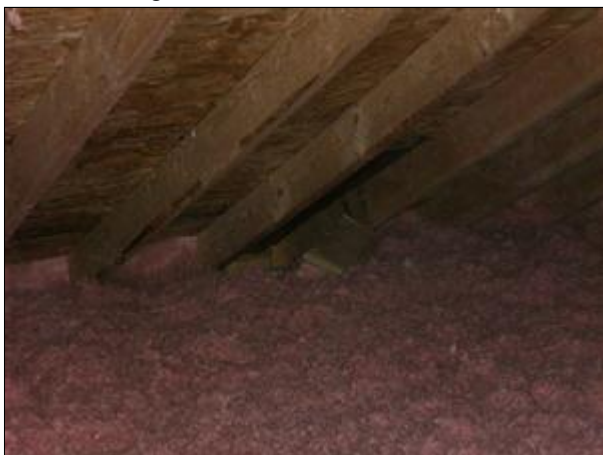
9.0 Picture 1