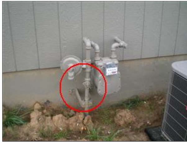
6.5 Picture 1

The main fuel shut off is at gas meter outside