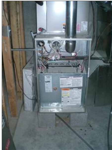
8.0 Picture 1

Furnace was operational at the time of the inspection.