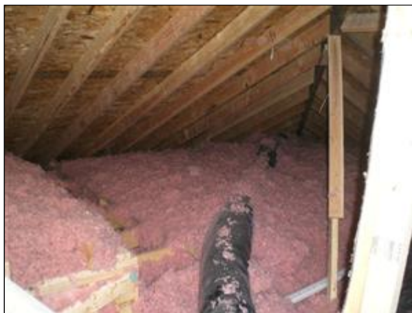
9.0 Picture 2