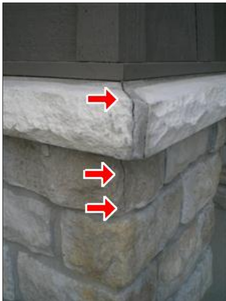
2.0 Picture 2

(2) There is cracking at the stone pillars at both sides of the entry way. Recommend qualified contractor investigate further and repair or replace as needed.