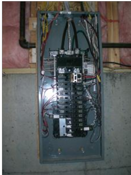
7.1 Picture 1

Main panel is located in the basement on the west wall.