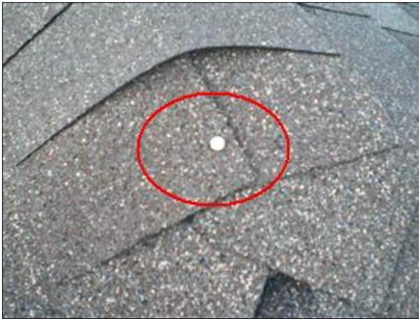
1.0 Picture 1

(1) I did not see any roof damage from recent hail storm. There were a few exposed nails - I would recommend covering with roofing sealant.