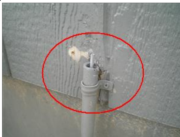
2.0 Picture 5

(4) Small amount of caulking and paint at west side of house.