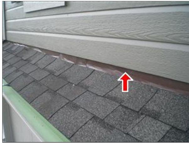
1.1 Picture 1

There is a section of flashing at the front above the garage that is banged up. It is working properly.