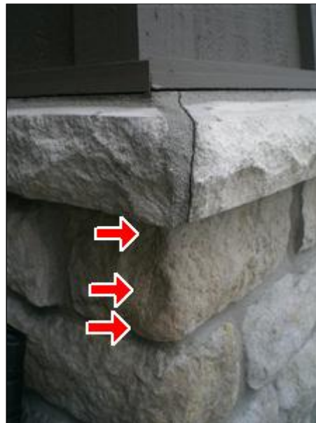
2.0 Picture 3