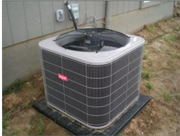
8.8 Picture 1

The ambient air test was performed by using thermometers on the air handler of Air conditioner to determine if the difference in temperatures of the supply and return air are between 14 degrees and 22 degrees which indicates that the unit is cooling as intended. The supply air temperature on your system read 51 degrees, and the return air temperature was 69 degrees. This indicates the range in temperature drop is normal.