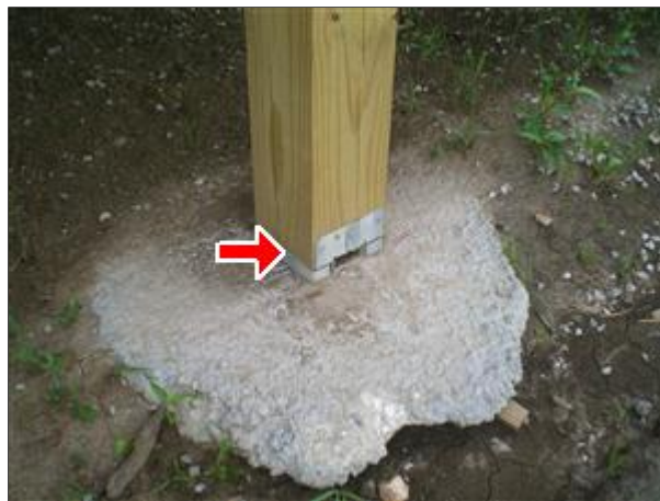
2.3 Picture 1

Make sure when the builder grades the yard & adds topsoil & grass that the deck posts are not covered with soil. Soil to wood contact will cause premature deterioration.