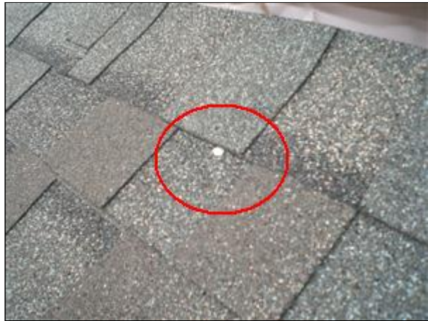
1.0 Picture 2

(2) There is an area at the front of the house that will naturally collect leaves & debris. Recommend cleaning out this area as needed.