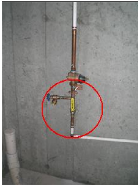
6.3 Picture 1

Main water is yellow handle valve in basement at north west corner