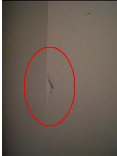
3.1 Picture 1

There is a small ding in the garage that needs to be patched and repainted.