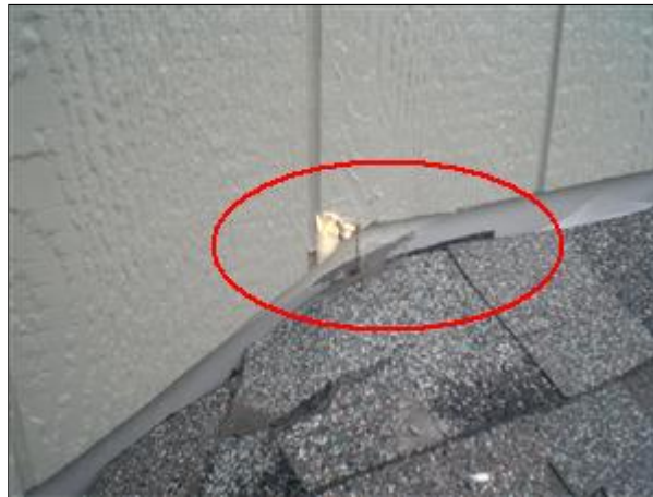
2.0 Picture 1

(1) There is a small section of siding that needs to be repainted on the east side second floor.