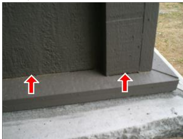
2.0 Picture 4

(3) Recommend caulking at base of front pillars.