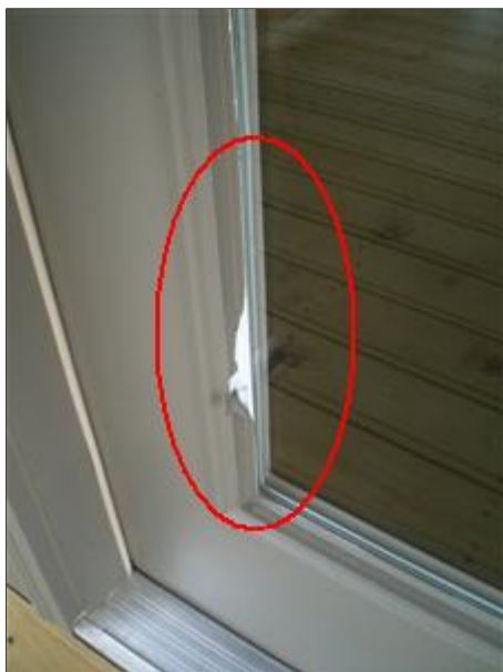
2.1 Picture 1