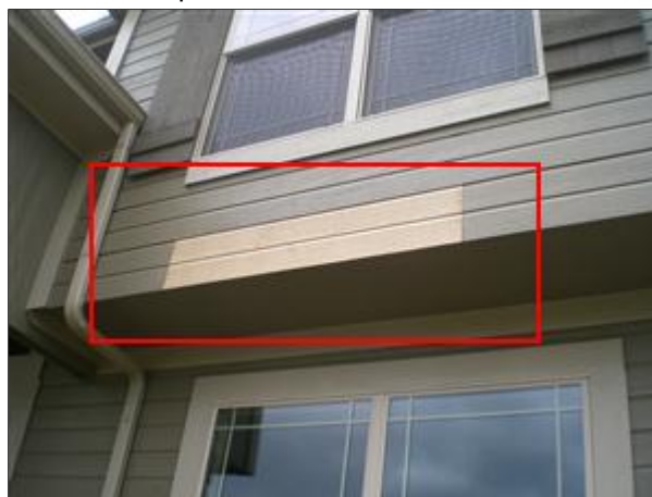
2.0 Picture 6

(5) There is a section of siding that has been replaced at the front. This will need to be caulked and painted.