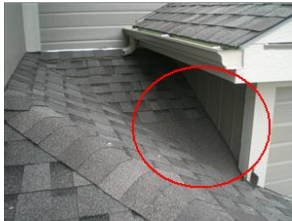
1.0 Picture 3

(2) There is an area at the front of the house that will naturally collect leaves & debris. Recommend cleaning out this area as needed.