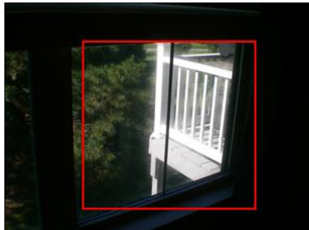
4.6 Picture 2

(2) There is some deterioration at the window in the master bedroom. Recommend qualified contractor repair as needed.