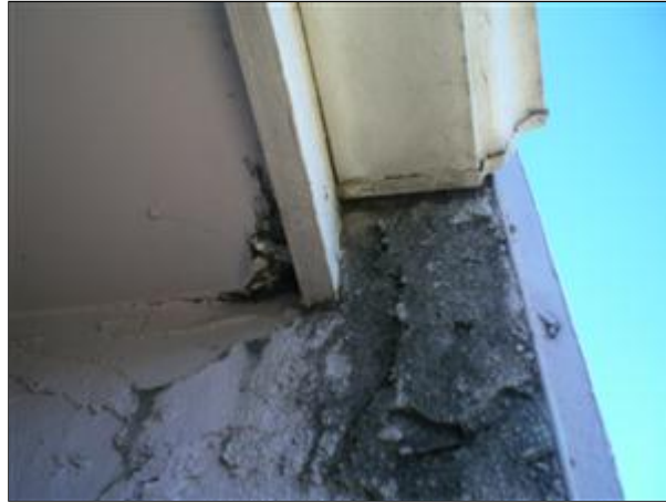
1.3 Picture 1

(1) Gutter at front of house is leaking and needs to be sealed. There is a mold like substance at this area that needs to be cleaned.