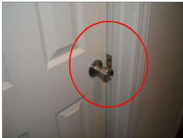
4.5 Picture 1

(1) Bathroom door in basement did not latch properly.