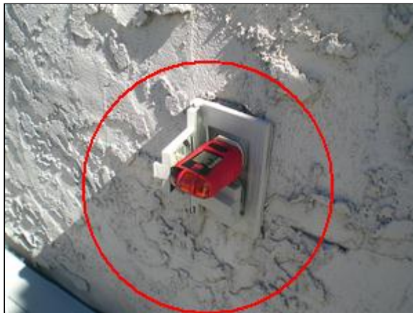
7.4 Picture 2 back of house outlet