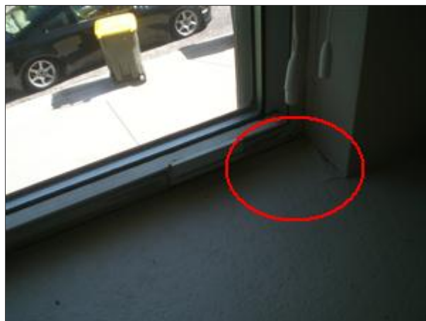
4.6 Picture 3

(2) There is some deterioration at the window in the master bedroom. Recommend qualified contractor repair as needed.