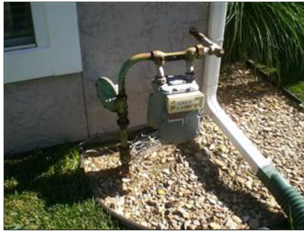
6.5 Picture 1

The main fuel shut off is at gas meter outside