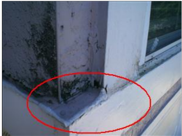
2.0 Picture 4