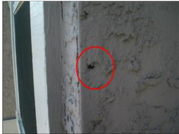
2.0 Picture 7 seal small hole above garage