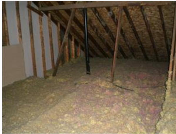
9.0 Picture 1

Attic is well insulated - there is an average of about 12" of insulation.