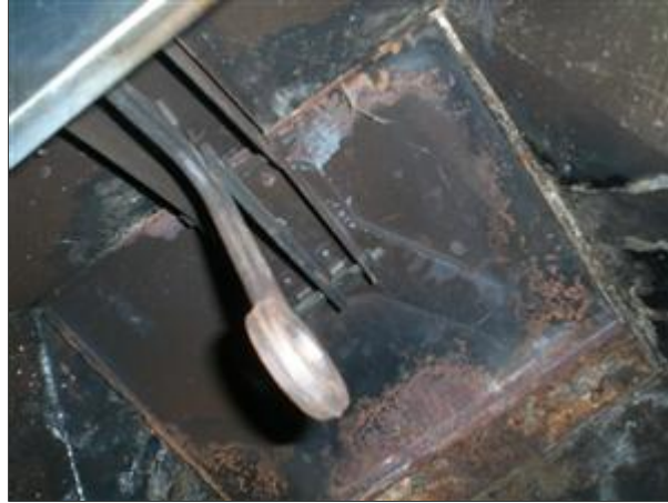
8.6 Picture 1

Gas logs must only be operated with the vent open. I recommend adding a vent clamp to make sure vent is always open to avoid accidentally operating gas logs without opening vent.