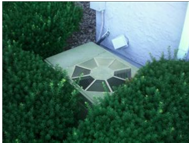
8.7 Picture 1

(1) The ambient air test was performed by using thermometers on the air handler of Air conditioner to determine if the difference in temperatures at the supply and return air are between 14 degrees and 22 degrees (the greater the difference, the better) which indicates that the unit is cooling as intended. The supply air temperature on your system was 58 degrees, and the return air temperature was 76 degrees. This indicates the range in temperature drop is normal. Unit was manufactured in 1988.