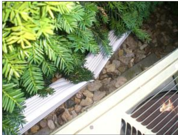
1.3 Picture 2

(2) Downspout at west side of house is damaged.