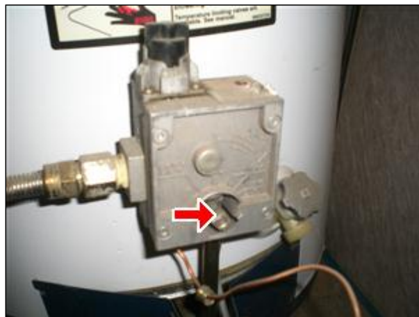
6.2 Picture 2 missing adjustment dial