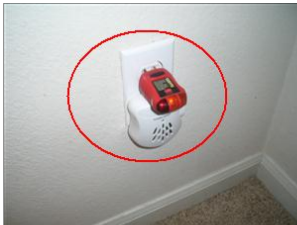
7.3 Picture 2

(2) There are several outlets that have the hot and neutral reversed. One is located on the east wall in the dining room, one in the north west bedroom on the east wall. Recommend qualified electrician service as needed.