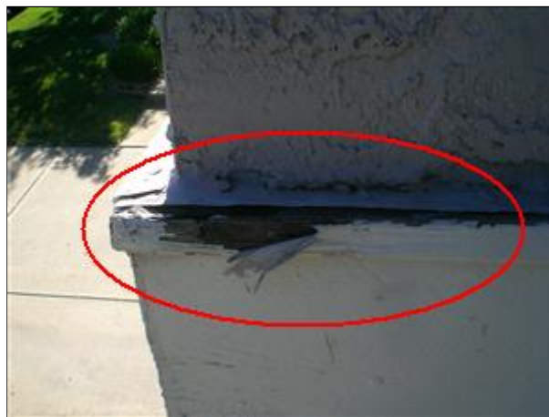
2.0 Picture 5 Trim above garage