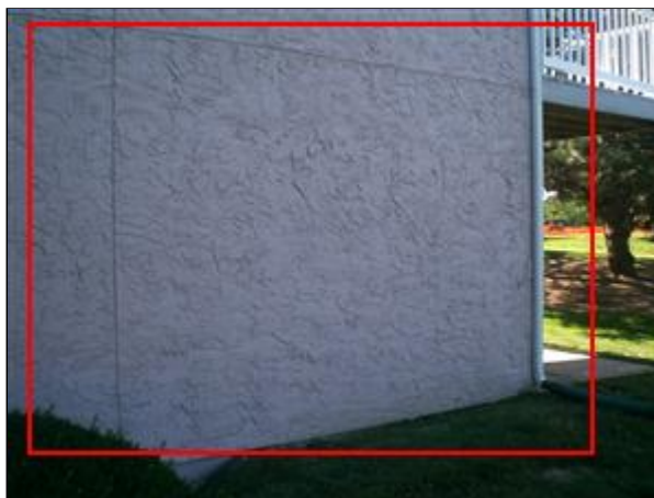
2.0 Picture 10 several cracks