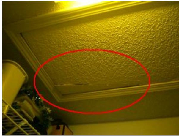
4.5 Picture 2

(2) Hatch to the attic was damaged and needs to be replaced.