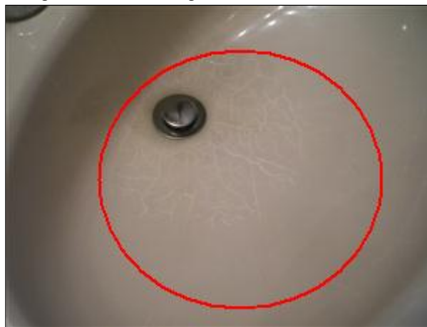
6.1 Picture 2

(2) There are several sinks that are starting to show some cracking at the time of the inspection. None were leaking at the inspection. Recommend monitoring for future leaking.