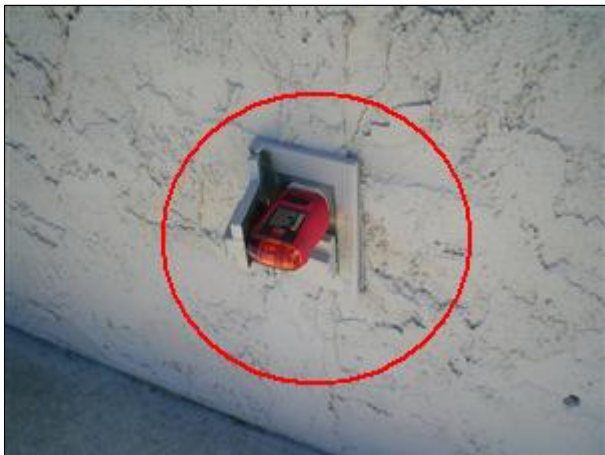
7.4 Picture 1 front of house outlet

Outlets outside house need to be a GFCI protected outlet to comply with modern safety standards. Recommend qualified electrician perform all electrical repairs.