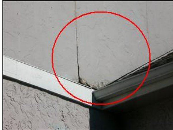
2.0 Picture 12

(4) There is a deteriorated section of trim on the east side of the house that needs to be repaired. Recommend qualified contractor repair or replace as needed.