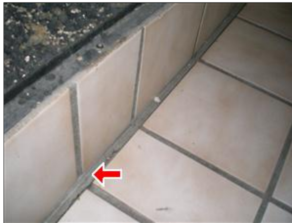
4.2 Picture 1