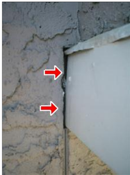
2.0 Picture 8 caulk