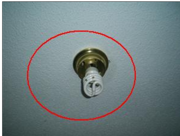
7.3 Picture 1

(1) By modern standards, exposed bulbs in closets are considered a safety hazard and should be replaced with an enclosed fixture. Several of the closets in this house have exposed bulb fixtures.