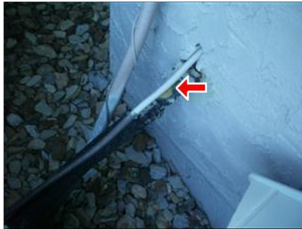
8.7 Picture 2

(2) Insulating foam at outside AC lines needs to be replaced