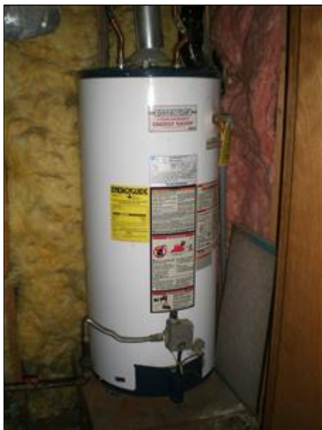
6.2 Picture 1

Hot water heater was operational at time of inspection. Manufactured in 2001. The hot water heater was missing the temperature adjustment dial.