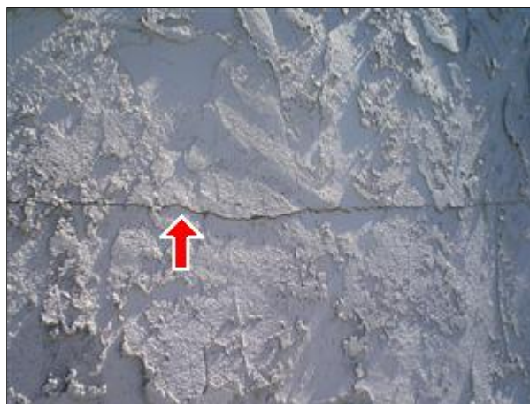
2.0 Picture 11 crack at chimney