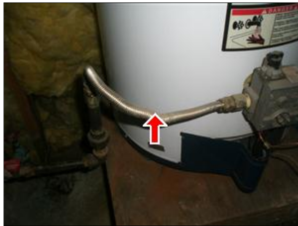
6.4 Picture 1 replace

Flexible gas line servicing water heater is not up to modern safety standards. A flexible gas line may be used in this application but it must be vinyl coated.