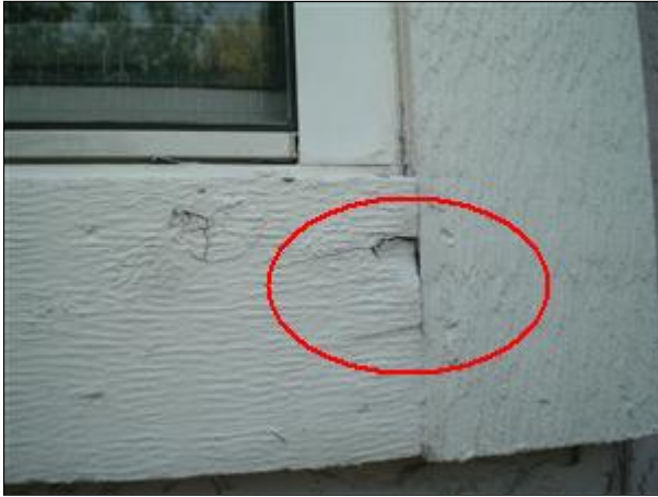
2.0 Picture 1 window at west side of house

(1) There is some deterioration / wood rot at some trim and at windows at the front of the house. Recommend trim above garage qualified contractor repair or replace as needed.