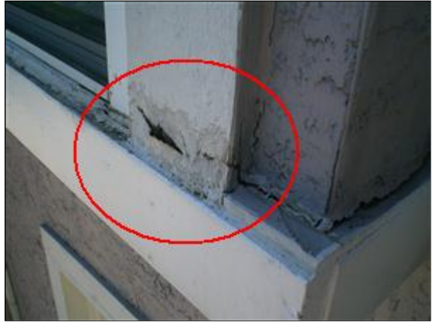
2.0 Picture 2 window above garage