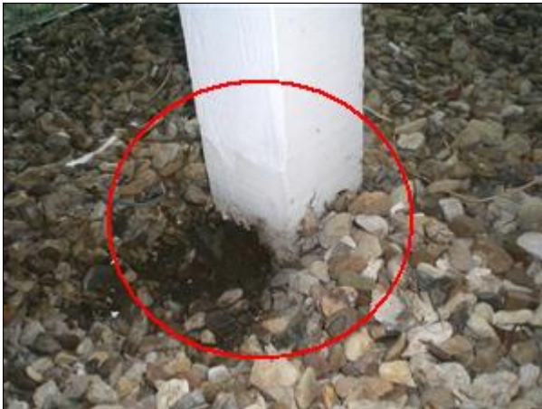
2.3 Picture 1

Gunter Pest Control found termite activity and damage at posts for stairs leading to front door. The bases of the posts are deteriorated to a point that they need to be replaced.