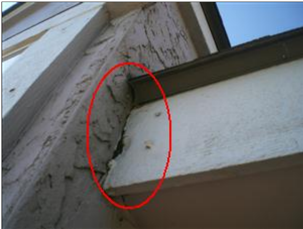
2.0 Picture 3 trim above garage