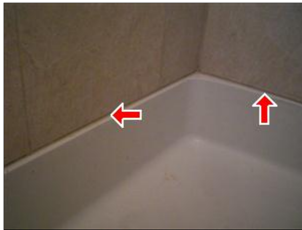
6.1 Picture 3

(3) Recommend caulking the bottom edge of the master bathroom shower.