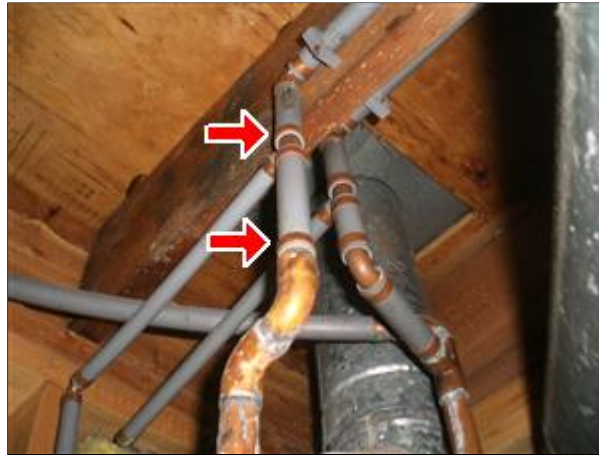
6.1 Picture 1

(1) Polybutylene plastic plumbing supply lines (PB) are installed in the subject house. Polybutylene has been used in this area for many years, but has had a higher than normal failure rate, and is no longer being widely used. Copper and Brass fittings used in later years have apparently reduced the failure rate. This subject house has copper fittings.