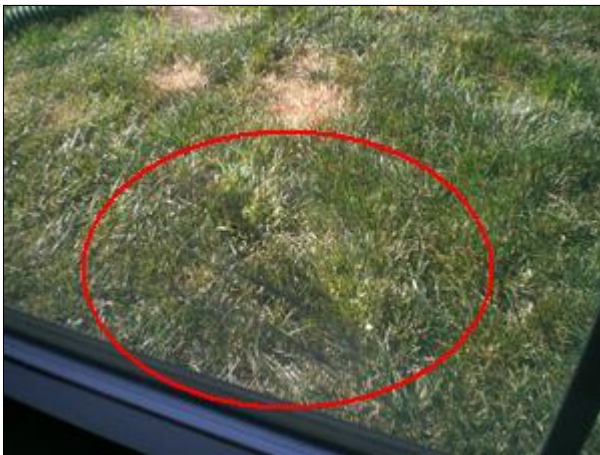
4.6 Picture 1

(1) There are several windows with damaged screens - noticed in dining room and basement office. The window in the dining room also has a damaged seal. The window is still operational but will not insulate as well as intended with a damaged seal.