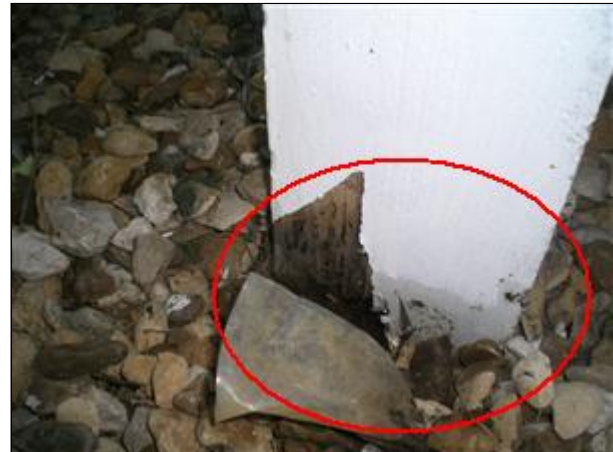
2.3 Picture 2