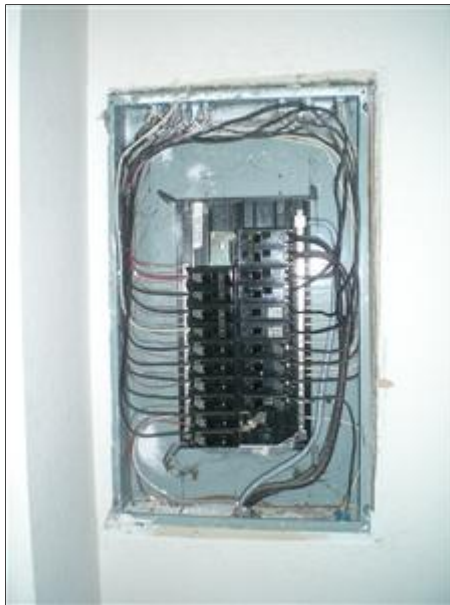
7.1 Picture 1

Main electrical in located in the basement on the east wall.