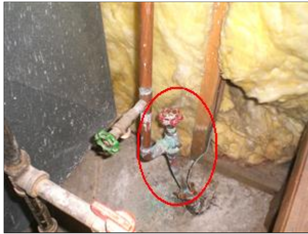
6.3 Picture 1

Main water shut off is located in the garage in the mechanical closet.