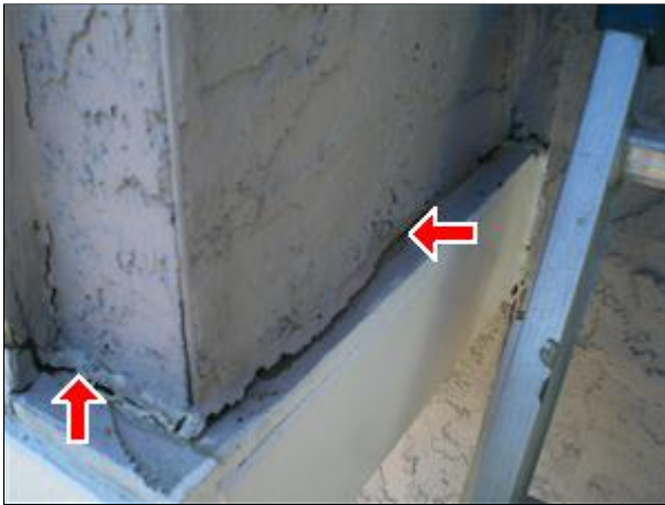
2.0 Picture 6 caulk

(2) There are several areas where gaps between the trim and stucco siding need to be caulked and sealed.