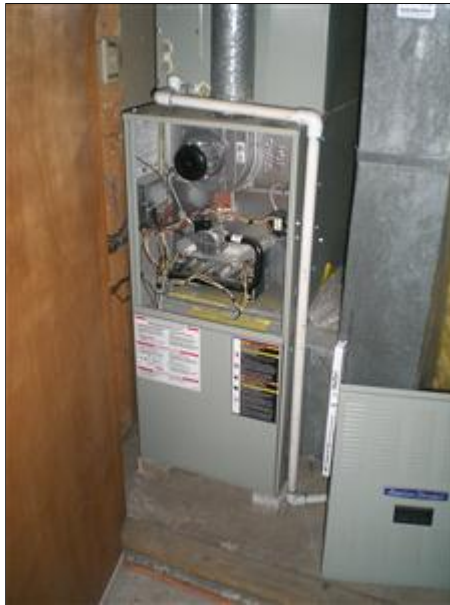
8.0 Picture 1

Furnace was operational at the time of the inspection. Manufactured in 2006.