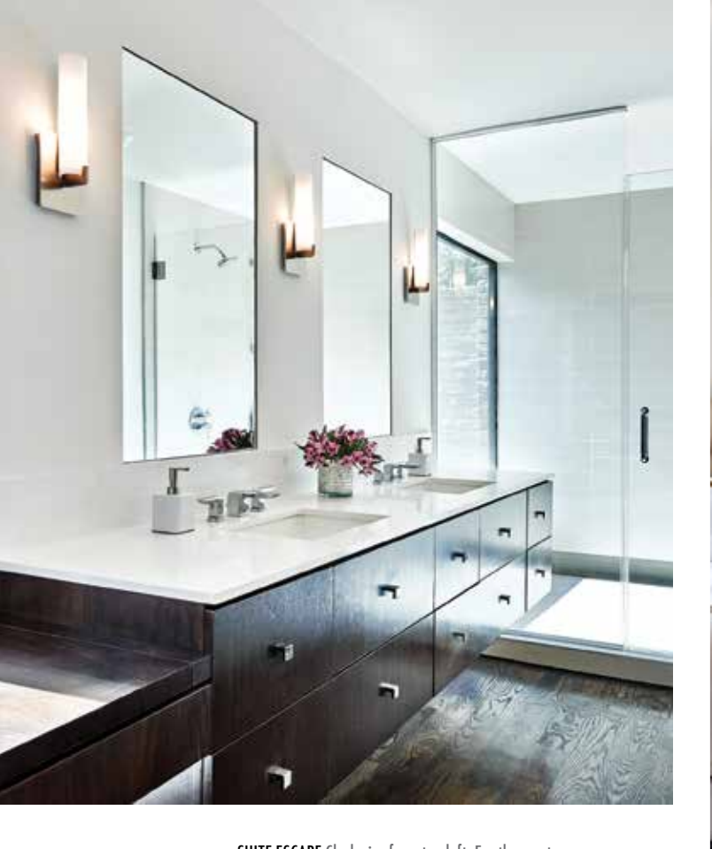
SUITE ESCAPE Clockwise from top left: For the master bathroom, the team at Content Architecture opted for a sleek shower with a linear drain and added a hidden vanity that flips up next to the double sinks; the master bedroom, which opens onto a private courtyard, is a calming oasis of muted shades and plush furniture like the Shaw bed by American Leather and the M Place by Malerba nightstand, both from Contempo Designs; one of the home's additional baths.