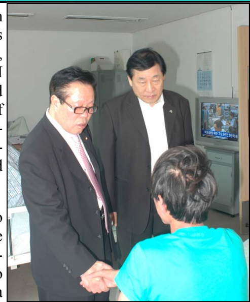
Mr. Lim visited a hospital for HD patients together with the Minister of Health, Welfare and Family

As a lawmaker, I have promised not to be embroiled in power struggles or political strife. I am committed to work hard in order to influence the formulation of policies beneficial to all persons with special needs. I plan to devote myself to making a society where principles and common sense work, the honest are not short-changed, and the disabled no longer suffer from social discrimination and prejudice.