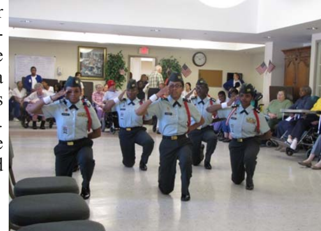
State champions performing drill routine for the residents of St. Claire Manor.

sang the Star Spangled Banner, the drill team performed their routine.