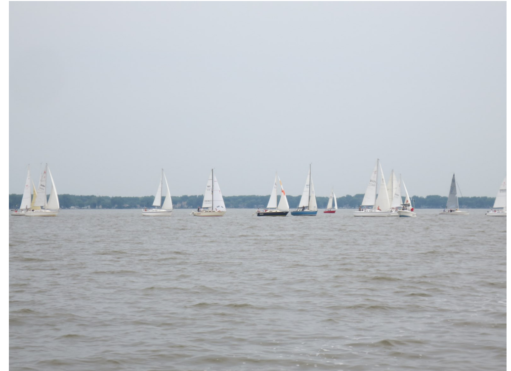
Boats battle the light winds during the Nodaway 150 Regatta 7-12-2014 (above)

Submit your sailing photos to communications@nnyc.org or upload them to our Facebook page and they might end up in a Zephyr!