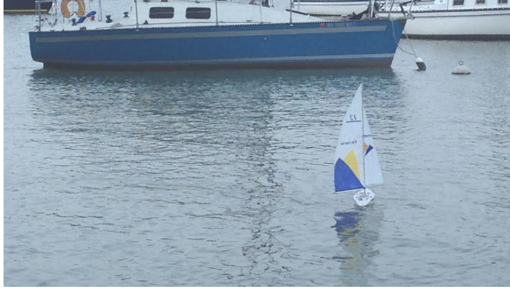
An RC sailboat running wing-on-wing in the harbor. (above)

Submit your sailing photos to communications@nnyc.org or upload them to our Facebook page and they might end up in a Zephyr!