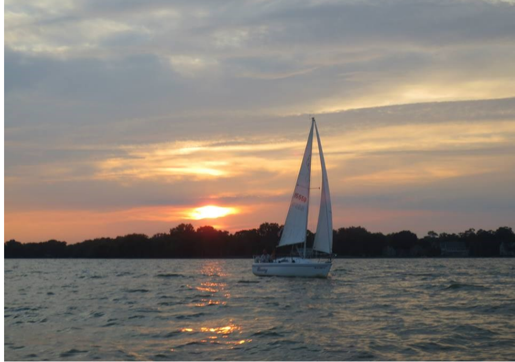
"Blessing" sailing in front of a setting sun. (8-10-2014) (above)