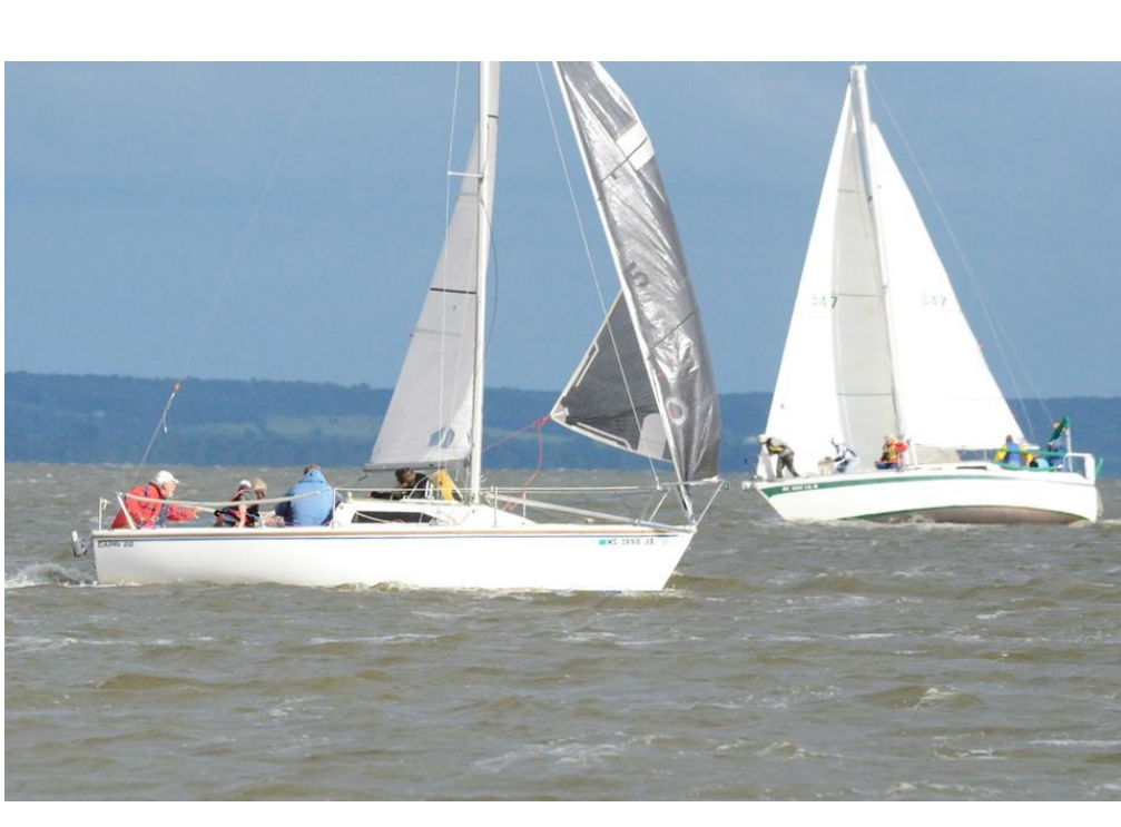
Tuesday night racing from 7/15/2014 (above)

If you still have a trophy from last year please make arrangements to return it by contacting Rear Commodore Jim Stolla at 920-858-1911.