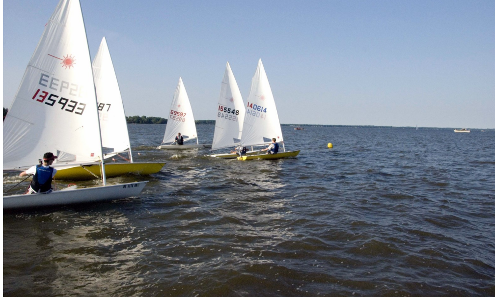
Lasers racing on 7/10/2014 (above)

There were 19 boats for our "Battle of the Harbors Fun Race" on September 2, 2014 (7 spinnaker, 12 jib and main). The individual division winners are as follows: spinnaker division Cosmic Muffin won with a corrected time of 41:00, jib and main division Chris Dan won with a corrected time of 43:11. The top three boats from each harbor were scored to determine harbor winner. In the spinnaker division Neenah won with 10 points (2, 3 and 5) while Menasha had 12 points (1, 4, and 7) In the jib and main division Neenah again won with 7 points (1, 2, 4) while Menasha had 19 points (3, 7, and 9). There was a very good turnout for the awards presentation at Holiday Inn River Walk where pulled pork sandwiches and favorite beverages were served.