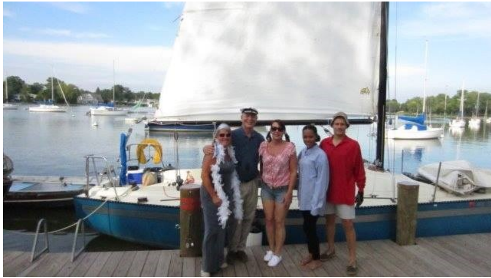
The cast of Gilligan's Island showed up on Scooter (9-9-2014) (above)