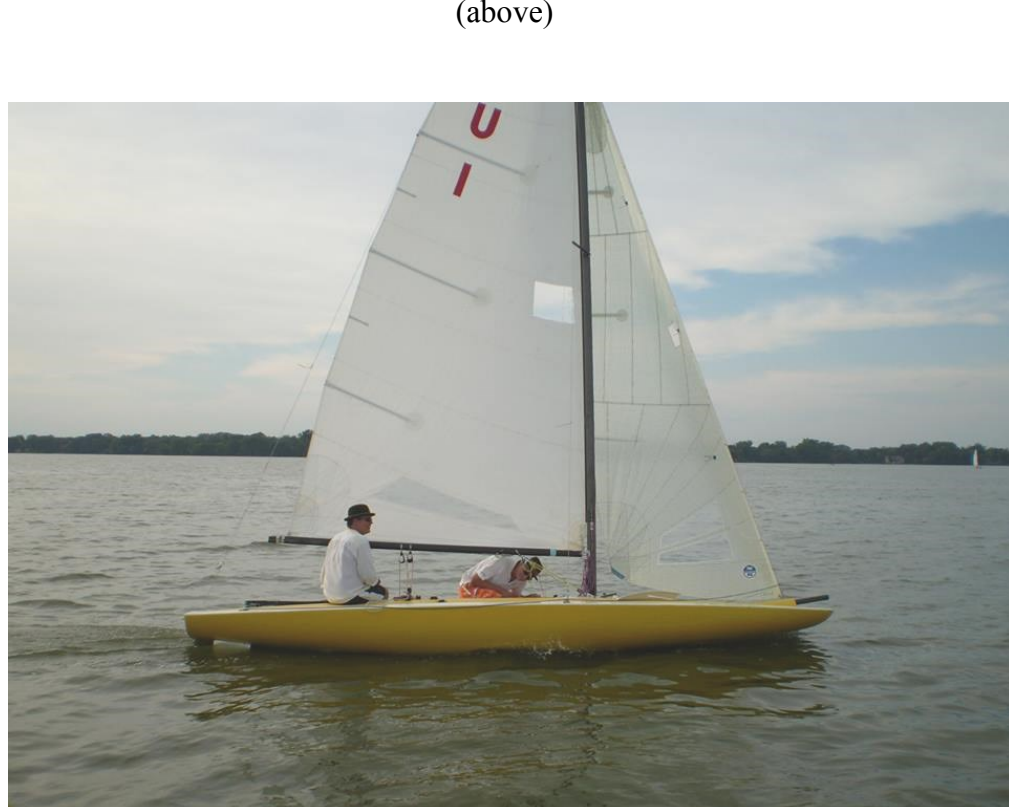
An I-20 joins in the fun on 9-9-2014. Classy hats, gents! (above)