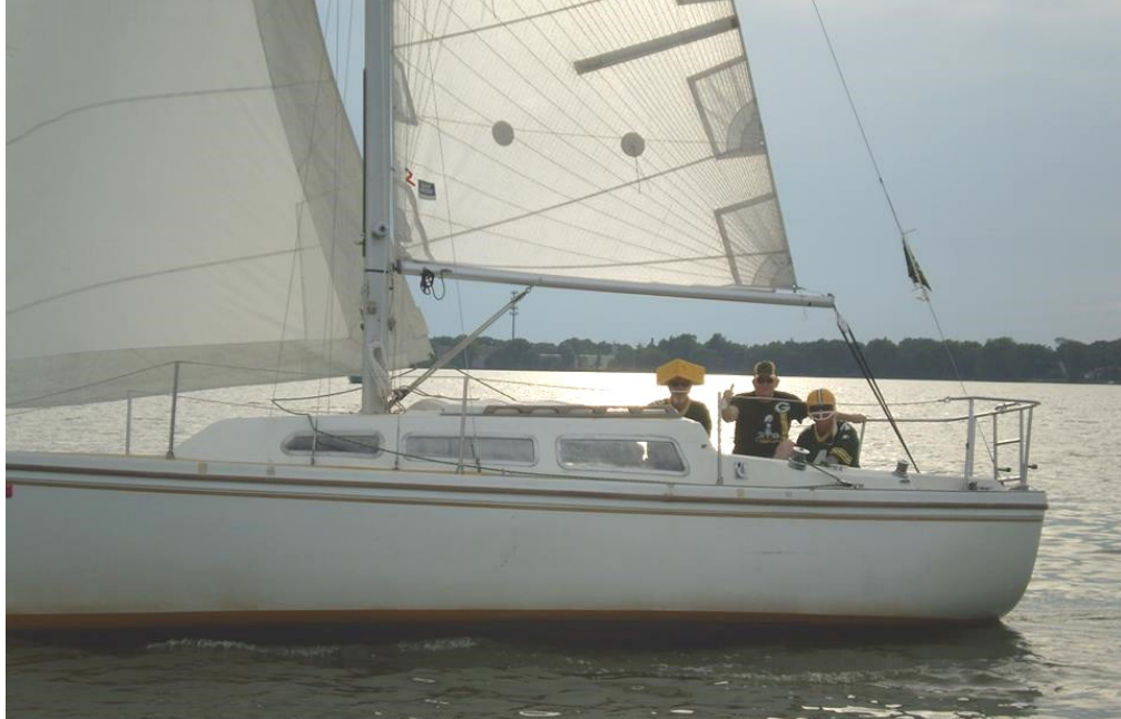
A boat of cheeseheads (9-9-2014) (above)