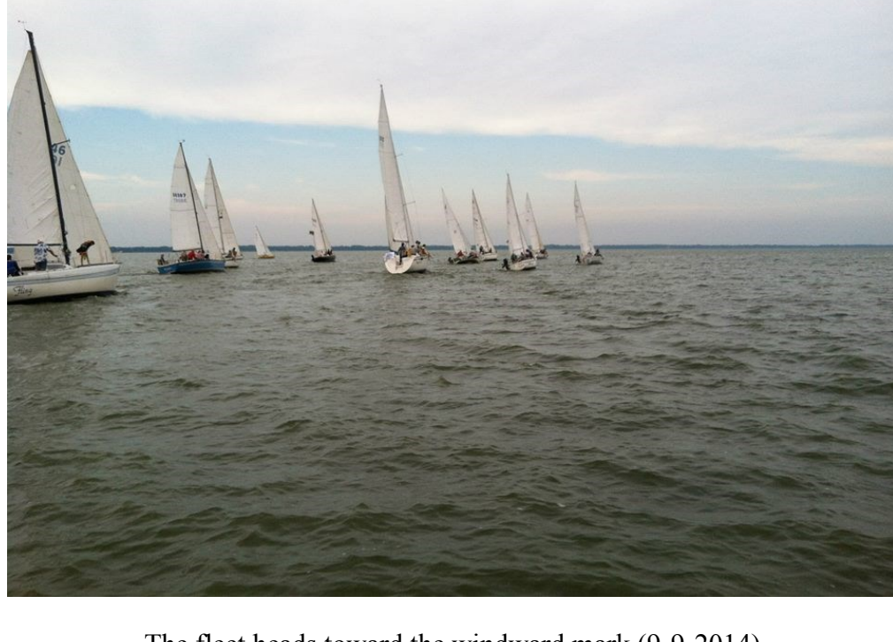
The fleet heads toward the windward mark (9-9-2014) (above)