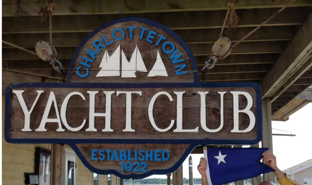
NNYC burgee hanging out in Prince Edward Island, Canada (above)

Let's see how many different yacht clubs, lakes, landmarks, etc. that we can get a picture of our burgee in front of. If you are going somewhere take a picture of our burgee and send in your submission to communications@nnyc.org and we will put it in the Zephyr and see where our burgee can end up! See our first example from Charlottetown Yacht Club, Prince Edward Island, Canada below.