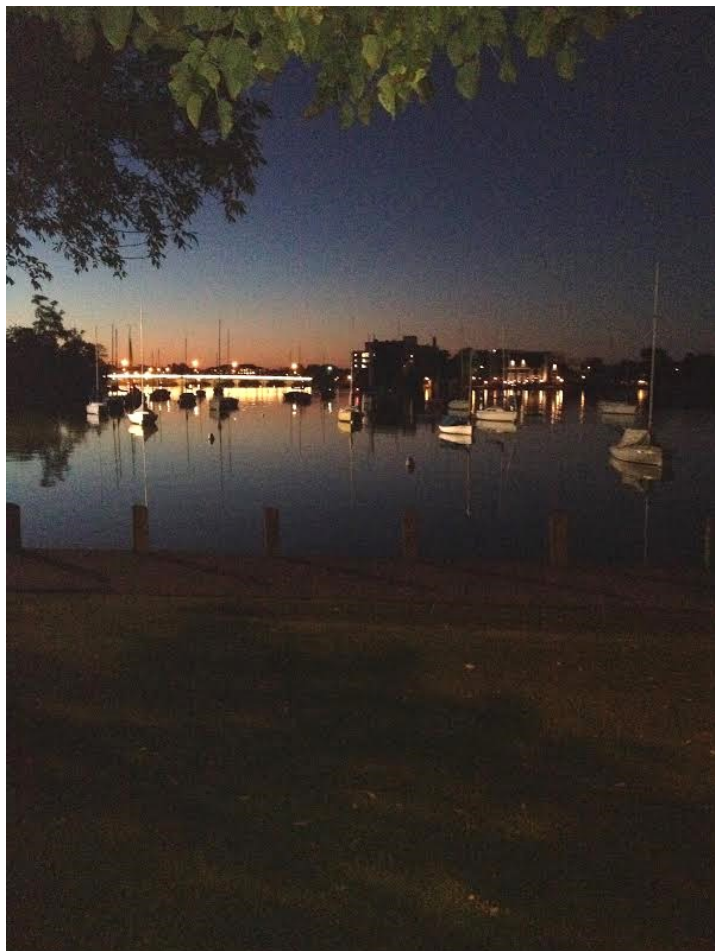
A quiet harbor sunset on the first day of fall (9-22-2014) (above)