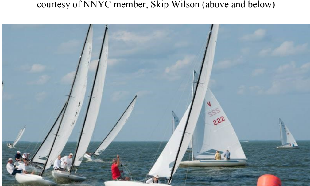
Flying Scots beat towards the windward mark after starting (below)