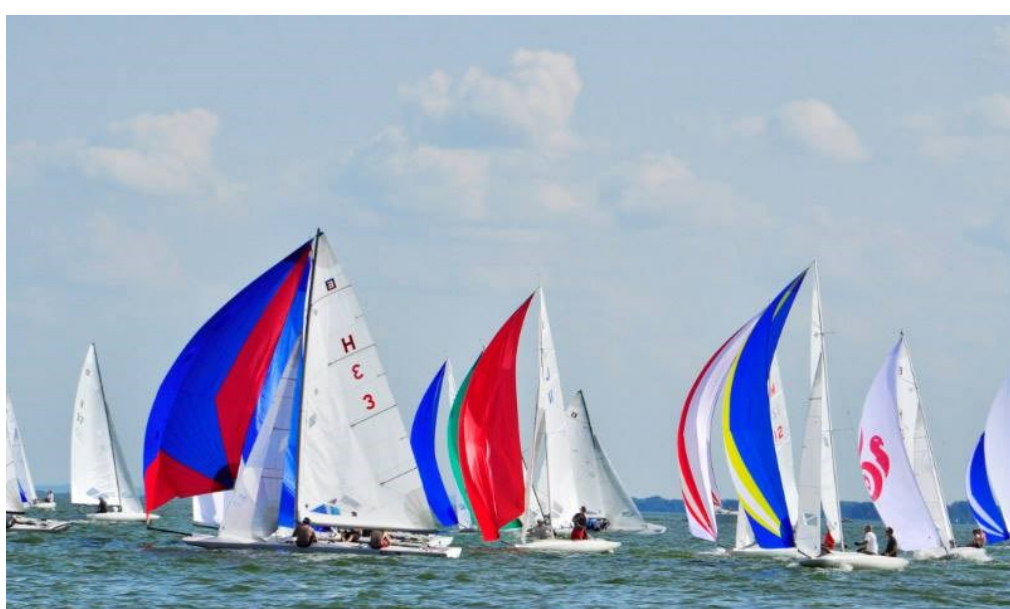
Some pictures from the ILYA 2014 Championship at Oshkosh