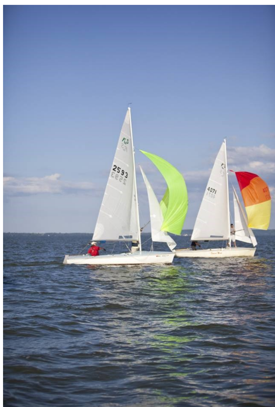
It's going to be a close finish for Flying Scots Second Wind and Out of Control . Chutes up heading for the line during the 2014 racing season. (above)