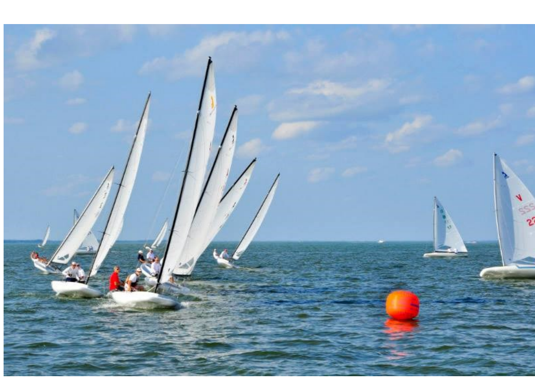
C Scows rounding the windward mark at the ILYA Big Inland. (above)

If interested, contact commodore@nnyc.org by April 10th.