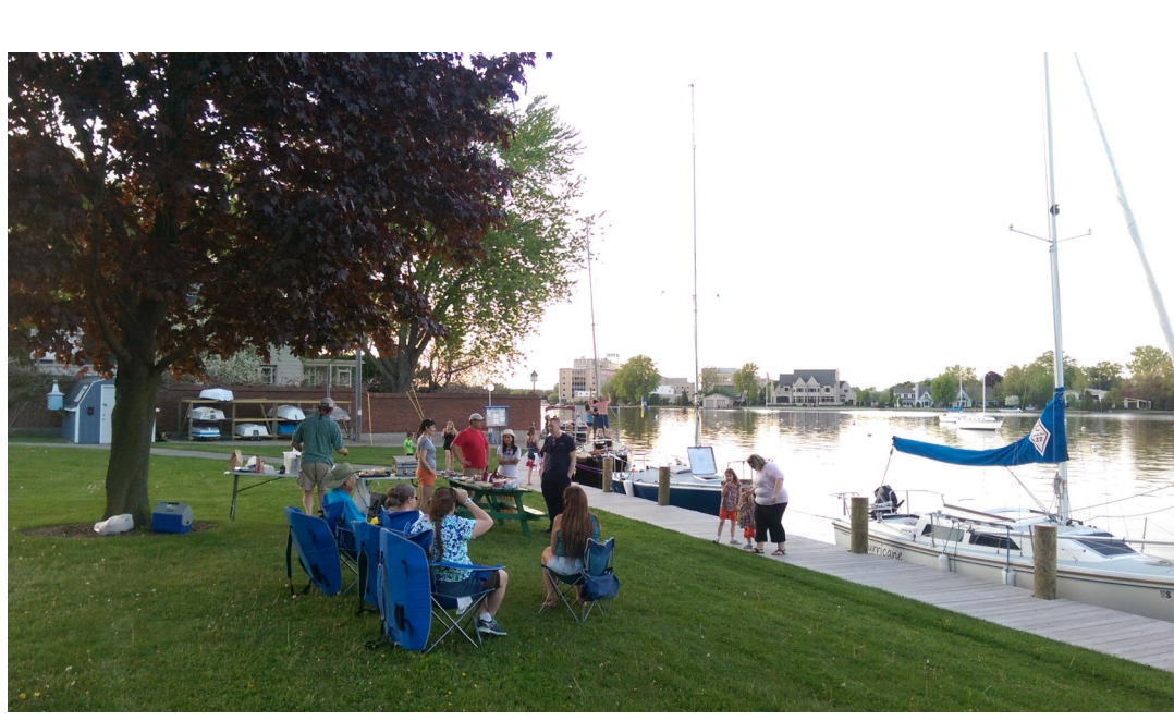
Enjoying the first Twilight Picnic and Cruise. (above)