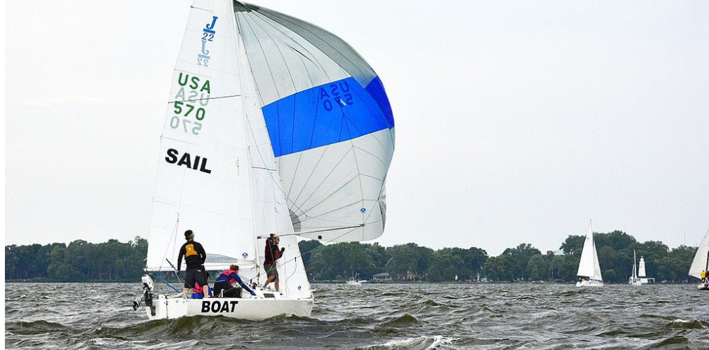
There must be too many letters in "spinnaker?". 6/19/2016 (above)