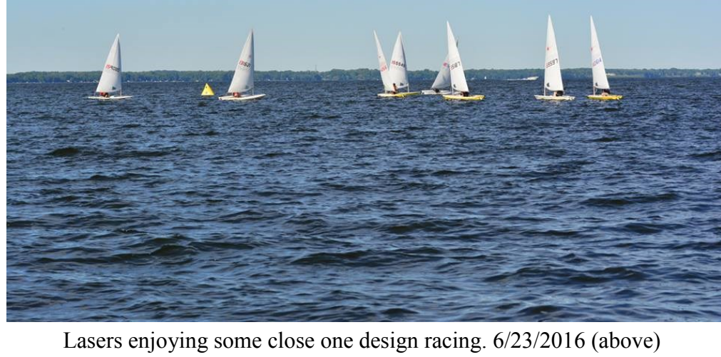
Lasers enjoying some close one design racing. 6/23/2016 (above)