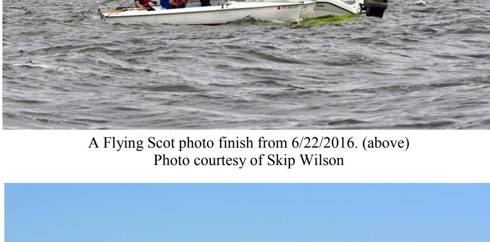
A Flying Scot photo finish from 6/22/2016. (above)

Check out this fun HCYC event! Email highcliffyc@gmail.com for more info.