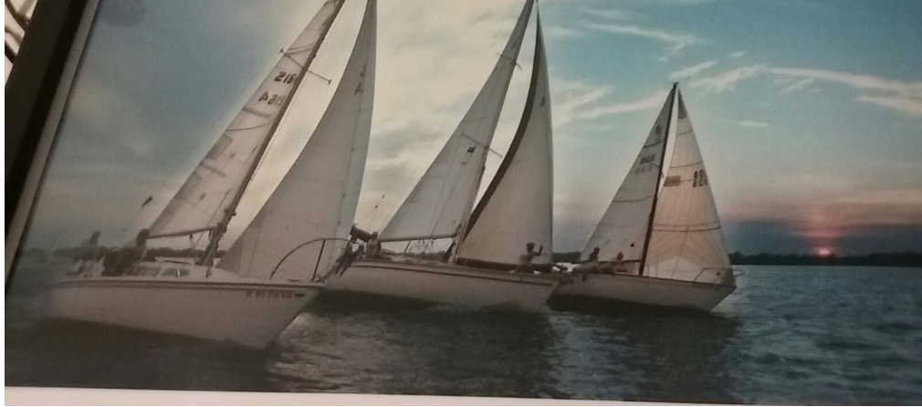
A classic still hanging on the wall. High Spirits , Baraka , and an S2. (above)