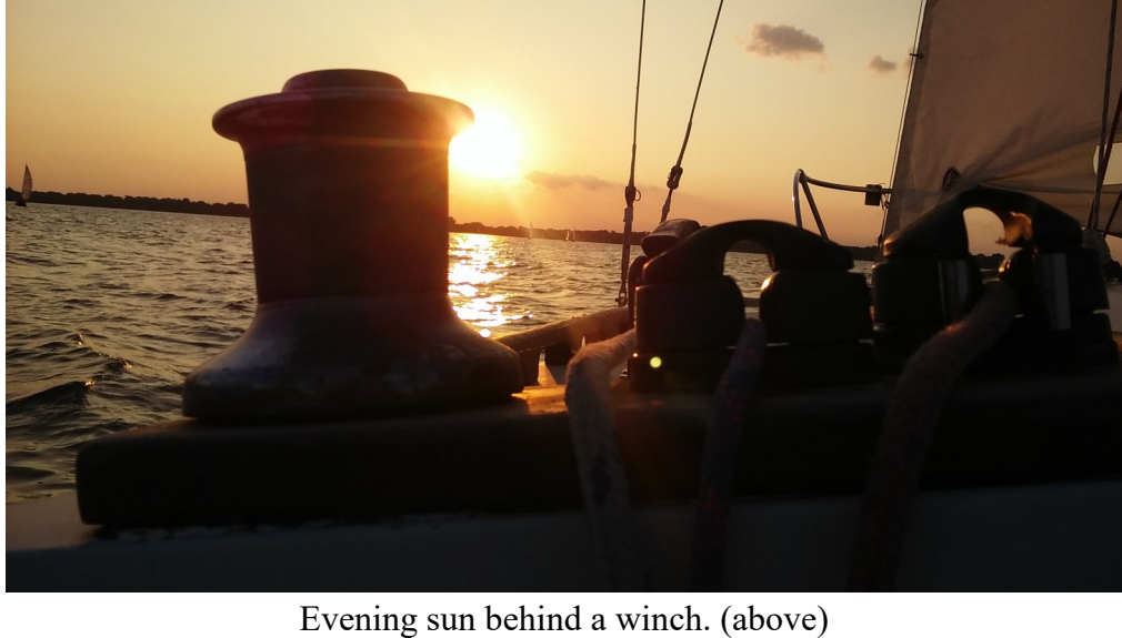
Evening sun behind a winch. (above)