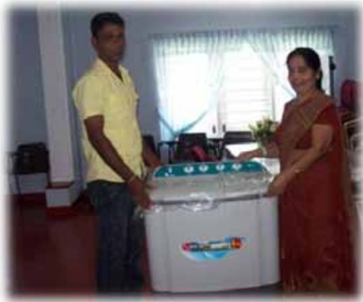
Winner received the washing Machine