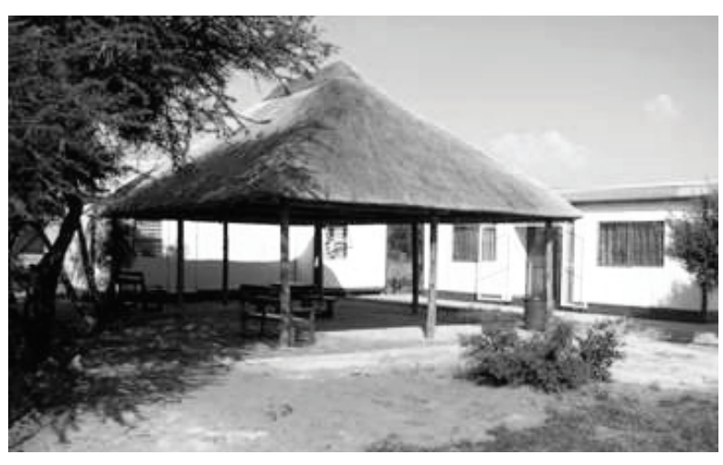
Open waiting area covered with traditional thatched roof.