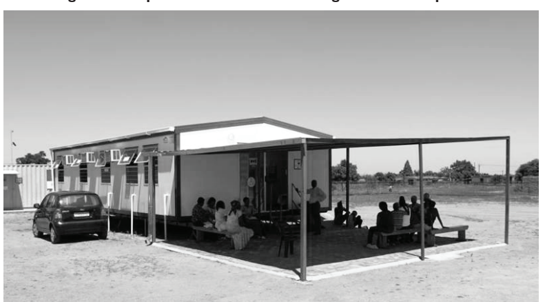
Open waiting area covered with corrugated iron sheets.