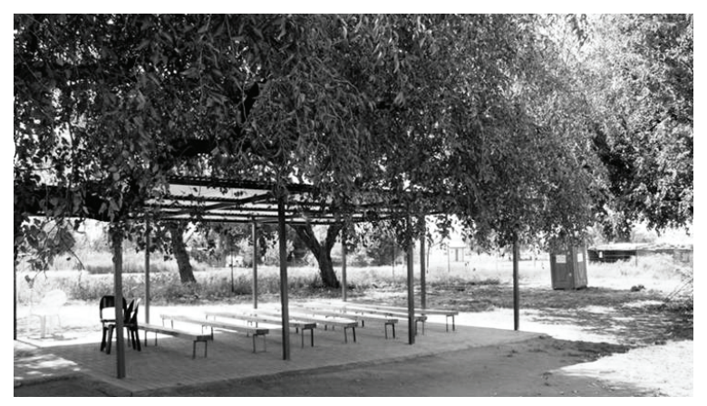
Fixed wood benches in open area

Seating arrangements for clients and those accompanying them were also considered. While some treatment sites chose fixed wooden and metal benches, others chose free-standing chairs to allow mobility to and from sunny or shaded areas.