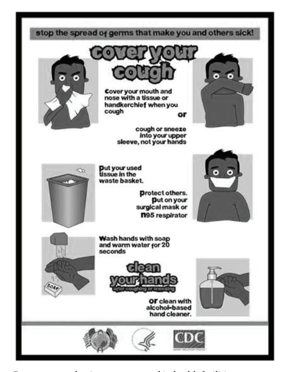
Posters on cough etiquette are posted in health facilities.

guidance. <sup>10</sup> The checklist covers four basic topics: 1) is there an enabling environment through which to implement TB infection control activities? 2) are there administrative controls and strategies in place to reduce infection aerosols? 3) are there adequate environmental controls to remove infectious aerosols; and 4) are staff, clients and others aware of personal protection strategies to reduce inhalation of infectious aerosols?