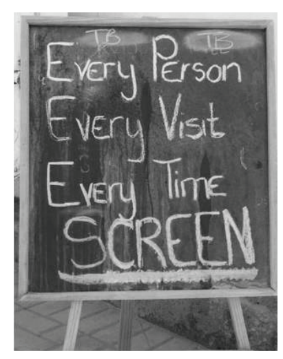
Visual cues remind clients and staff of protocol.

2. Each Infection Control Manager was encouraged to appoint one or two TB Infection Control Officers to assist the Manager in training "Cough Officers." "Cough Officers" are the first point of contact for clients arriving at a treatment site. Their responsibilities include conducting verbal screening for cough with all new clients, providing on-the-spot cough etiquette education and tissue paper for patients to cover