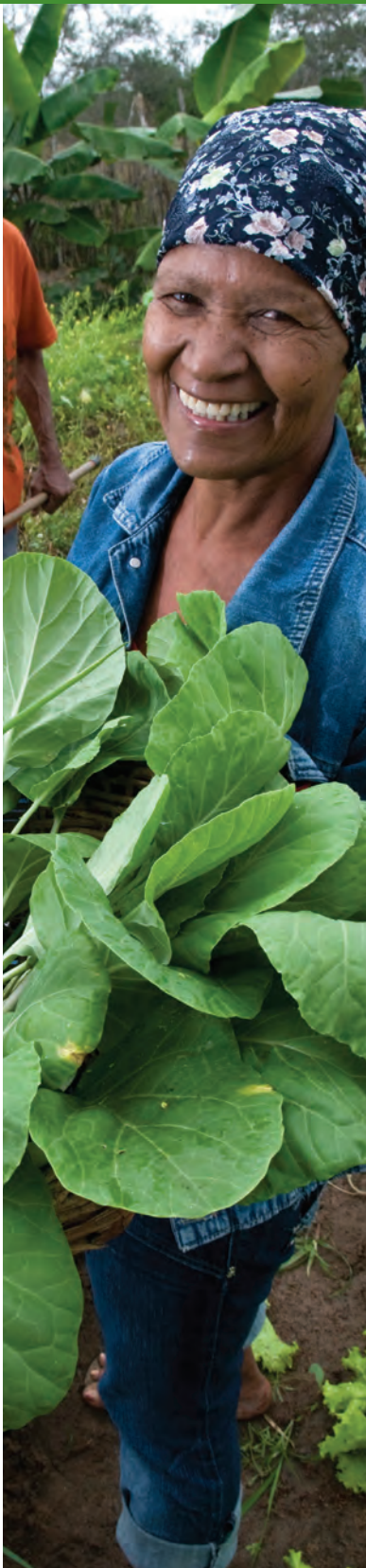
Rick D'Elia for CRS.

In 2012, our total expenditure in support of agricultural programming was $146 million. This represents a twofold increase over the level of expenditure in 2006. With this expenditure, we reached 1.5 million