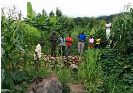
Members of the Watershed Committee standing on a large (about 12-m) check dam, which has reclaimed a barren gully, Lingoni.