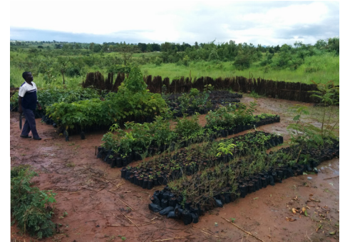
Tree nursery in Domasi.

Afforestation. WALA afforestation activities include the raising and transplanting of trees (indigenous), fruit trees, and grass. Afforestation assists in groundwater recharging through increased cover and soil retention. Vetiver grass was raised in nurseries and transplanted throughout the watershed. Vetiver grass grows quickly and reduces erosion along embankments or reinforces watershed treatments.