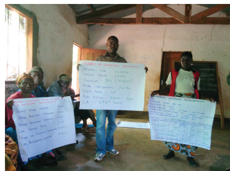
Mitumbira's Watershed management structure and achievements.

WALA has implemented watershed management activities in 32 areas across eight districts. Over three years, WALA selected communities, formed Watershed Committees, trained technical staff, mapped watersheds with GPS technology, and facilitated construction of watershed treatments. WALA treated 2,883 hectares with 1,981 km of erosion control measures, or more than three times the length of Lake Malawi. The watershed treatments included water absorption trenches (33 km), continuous contour trenches (919 km), stone bunds (318 km), check dams (333), marker ridges (377 km), and 339,336 planted trees. WALA invested over $2.2 million in Food For Work (FFW) incentives, representing a cost of $1.11 per structure-meter.