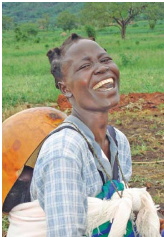
Author Sudan South

People’s coping and survival strategies are greatly enhanced as SILC builds up social support networks and a community safety net while strengthening financial and physical assets, thus reducing risk . During times of hardship, SILC members have a