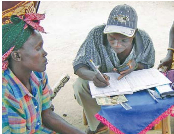
CRS Sudan South

Anyone needing a loan puts forward his or her request publicly to the SILC group members. Approval of the loan rests with the General Assembly; the loan may then be disbursed immediately. Loans are provided for consumption, investment, or household expenses that are agreed to by the group and noted in their by-laws.