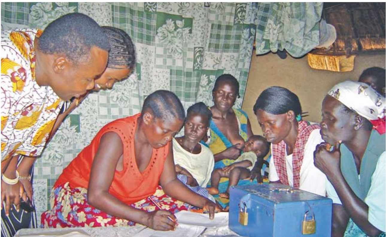
CRS Sudan South

contributions by mutual agreement. This means that the entire group stops saving. This can be attributed to seasonal demands that make it difficult to make the weekly contribution, or because their agricultural activities leave no time to attend weekly or bi-weekly meetings. While it is important to ensure financial discipline and regular savings, it is a reality that rural incomes are unstable and variable. Thus, SILC groups benefit from the seasonal flexibility built into the methodology. Regardless of the suspension, however, any outstanding loans must be repaid . Thus, meetings will continue to allow for the repayment and disbursement of loans as well as social fund contributions, but there will be no savings contributions.