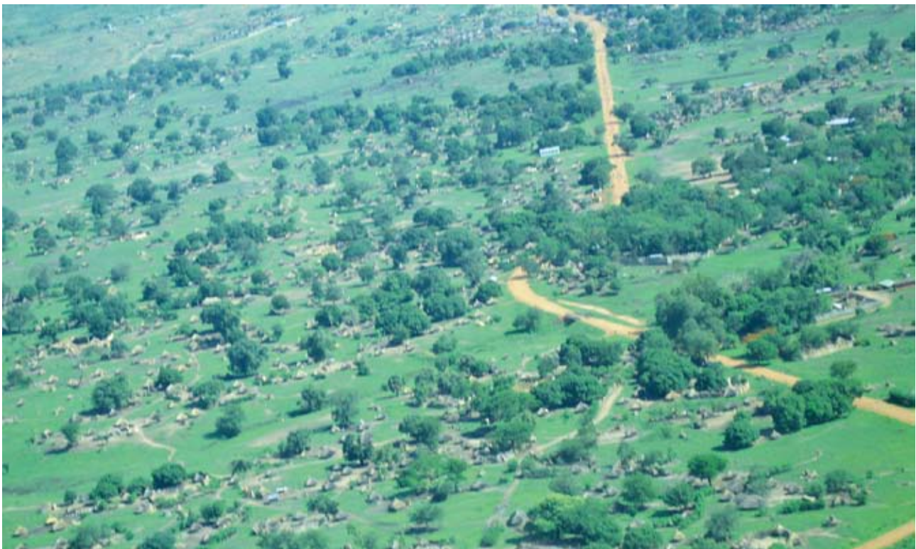
Author Sudan South

These are external threats and hazards that may impinge on people's lives at any time, and reduce their capacity to successfully implement their livelihood strategies or otherwise live in human dignity. Vulnerabilities are commonly described in three main categories: