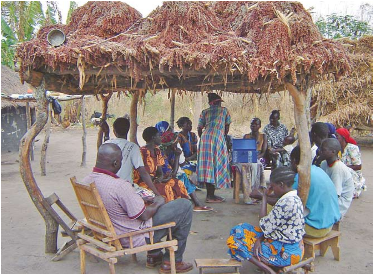
CRS Sudan South

The strength of assets is an important factor in how successful people's IHD strategies will be. SILC identifies and builds upon what assets people are already using and sustain, and also strengthens and increases the assets of individuals, households and communities over time.