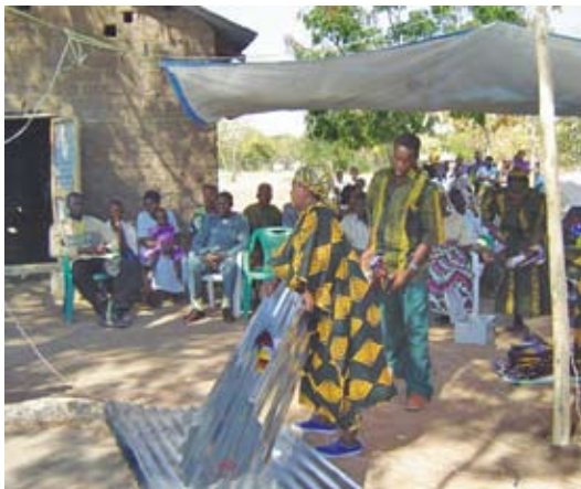
Profit of SILC - a member collecting her share of two corrugated iron sheets.

In the village of Lubuga, in Missingwi District Tanzania, a group of 32 people started a SILC, called "Africa Inland Church" as part of a CRS - Ryan Foundation sponsored Agro-enterprise project.