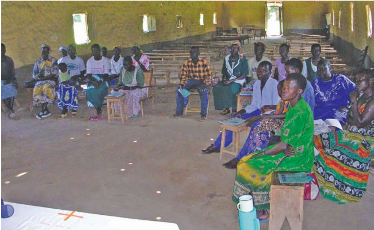
CRS Sudan South

one another, so they can attend regional trainings and contribute their expertise. This lateral learning not only gives them recognition, but it allows for practical training sessions. Beyond formal trainings, field agents, community mobilizers, project managers and clergy foster lateral learning through exposure visits to other Dioceses. Clustering allows for healthy rivalry as Diocesan branches compare each other's performance. This healthy rivalry will set the performance bar higher, even beyond the standards mandated by CRS.