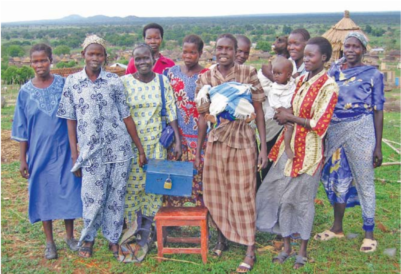
Author Sudan South

Group Formation - SILCs consist of self-selected groups of individuals. Members select each other on characteristics of trust, honesty, reliability, punctuality, good standing in the community, hard working, savings potential and similar social status. SILCs are made up of as few as 10 and as many as 25 individuals. Groups self-select their members, usually from among the adult population within the community. Membership is open to women and to men but, in the case of mixed groups, at least three of the five Committee members elected to manage the group should be female. Group members who hold public office (Chiefs, MPs or other administrative officials) are ineligible for Committee