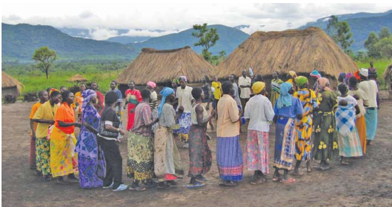
Author Sudan South

its financial assets among the members. As the end of the cycle approaches, no new loans are issued and old loans are repaid. When all of the group’s cash has been recovered, the money is shared out among the members on the basis of a formula linked to the value of each person’s savings. At this time, the group may reorganize or decide to take some time off to cope with seasonality 5 . Those group members who do not wish to continue may leave, and new individuals may be invited to join the group.