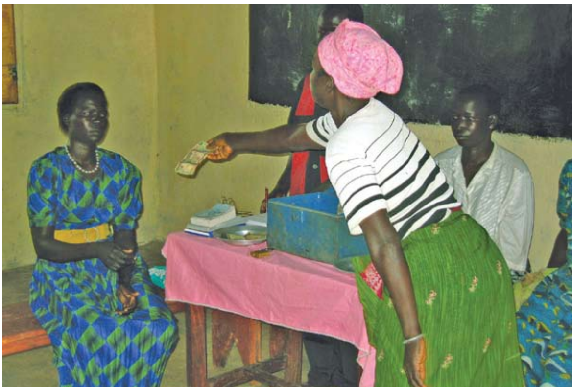
Author Sudan South

Credit - Members' savings and group earnings are used as a fund for internal lending. SILC members set loan terms. During the first cycle, it is normally the case that loan terms are as little as one month and do not exceed three months, but this may change in subsequent cycles. One-month loan terms limit the types of activities in which members can invest. In places where economic activities involve agriculture, longer loan terms may be needed (up to six months). In subsequent cycles, groups may allow longer-term loans, but it is inadvisable for these to exceed six months because longer loan terms tie up capital that other members may need. Interest is charged on loans and falls due every four weeks/month. Interest must be paid every month, regardless of the length of loan term. The amount of interest charged varies from SILC to SILC because each group decides on the interest rate; however, interest is set at a flat rate (to keep calculations simple) and