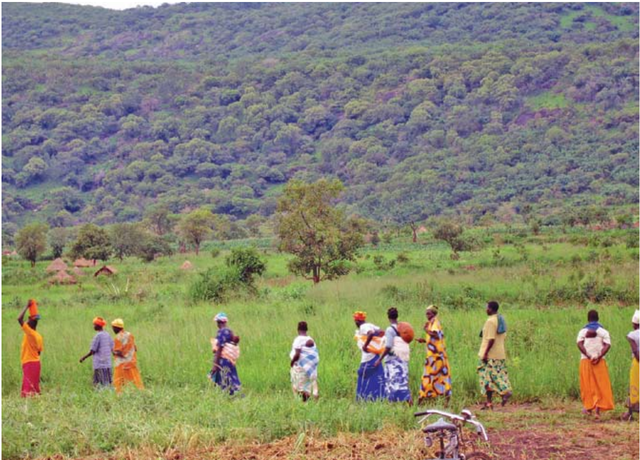
Author Sudan South

social, economic and financial system to fall back on. The coping mechanism is available and accessible right in their communities and individual survival is alleviated through peer support and access to an emergency or social fund. People in the community are not dependent on handouts from external organizations or institutions and become self-reliant. They have access to accumulated savings, internal loan mechanisms and grants from the group. It helps them to recover, protect, diversify and maximize assets .