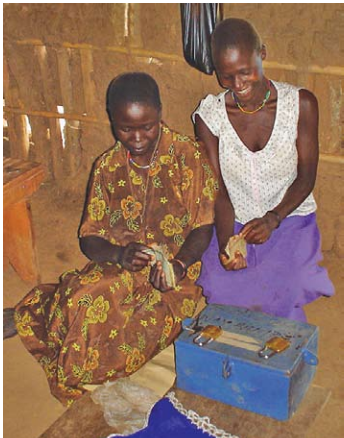
CRS Sudan South

Poverty particularly affects women and is primarily caused by low remuneration of income-generating activities, limited income-generating opportunities for rural populations, and poor access to financial resources. The poor have few opportunities to diversify their income-generating activities and have limited access to financial services due to lending practices that fail to target the poorest of the poor. Women, who usually require the smallest loans, are especially excluded from entering the credit market. Women face considerable cultural barriers that restrict their access to land and economic decision-making (Adotevi-Dia M. 2001).