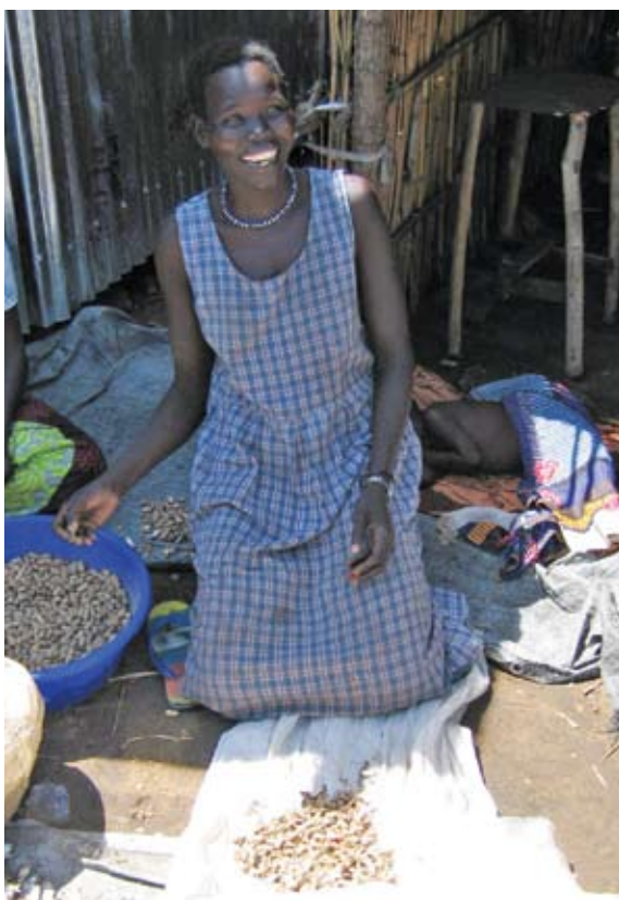
Author Sudan South

(PMG) to support and strengthen their agro-enterprises financially. In a cluster area, up to 12 SILC/FFS groups can form a PMG, and each group contributes money for the functioning of the PMG. Funds contributed by the different SILCs are used to buy collectively agricultural inputs (seeds, fertilizer, etc.) and market collectively individual and collective produce, to give loans to SILCs with a shortage of lending capital, towards insurance of the members in case of death or sickness. PMG is being administered by committees made up of SILC members. The committees prepare the general assembly meeting during which all SILC members participate and where transactions are conducted 14 .