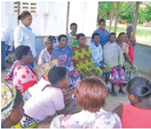
Members of Upendo group undergoing training

Upendo SILC group is one of the newly established groups under the CRS - Archdiocese of Mombasa OVC project in Kilifi on the Kenyan coast. The group has 29 guardians of orphans and abandoned children, mainly women (26). Following the start of the OVC project in 2004, caregivers came together and formed a large group of over 129 members devoted to taking care of orphans and vulnerable children left behind by their parents. Although the group has been faithful to the activities of the project, it was challenged by lack of income to fully support the children in their care. They therefore started a rotating savings and credit association (merry-go-round in November 2004) through which they have been able to collect money on a rotational basis and give it to one person or purchase a goat and sometimes food for the neediest households.