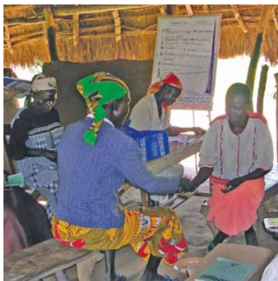
CRS Sudan South

Self-regulation - SILC group members agree on a set of rules, by-laws or a constitution, to guide their activities. These rules are written into the SILC Constitution that provides authority to the Committee members and a framework for regulation and dispute resolution. The Constitution specifies the terms and conditions of savings and lending and how the Social Fund will operate. Each member of the General Assembly may be assigned one or more rules to remember. This has the effect of reinforcing the rules so that after