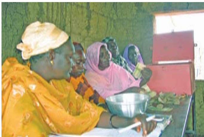
CRS Sudan North

girls) and healthcare, increasing community vigilance, securing continued access to safe and clean drinking water, health and sanitation, natural disaster mitigation,