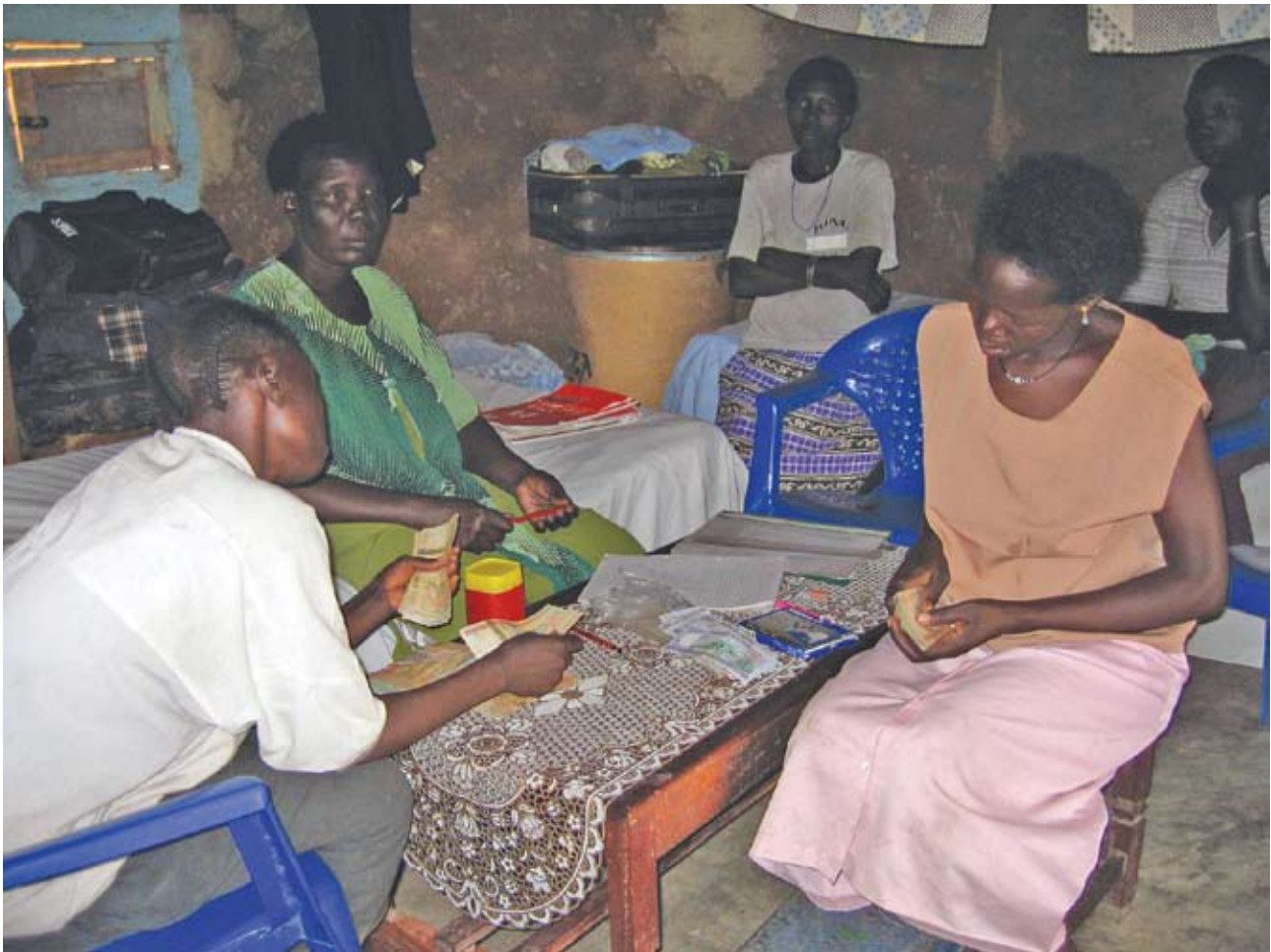
Author Sudan South

Experience in Africa indicates that a group that is larger than 25 or 30 members tends to be less cohesive than groups with fewer members. When groups are large, meetings tend to take a long time and the work of the Management Committee is onerous. It is also the case that very small groups are expensive to train and expensive to visit as the cost per participant is higher. Larger groups are usually found in settled communities where people live in villages. Smaller groups are often found in areas of low population density or where the level of trust due to incipient relationships among individuals (as in refugee camps) may be low. It is recommended to form groups of not less than 10 and not more than 25 members.