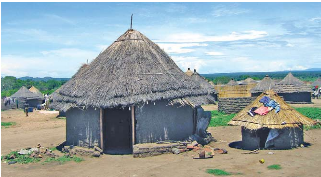
CRS Sudan South

Associations (ROSCAs) and Accumulating Savings and Credit Associations (ASCAs) 2 . In a typical ROSCA, members join together to save a fixed amount of money on a regular basis. During a meeting, one member will receive the contributions of the group that day. The order in which members have access to these contributions is determined by prior agreement of the group members, reached during a group meeting, or through a lottery or bidding process. The group continues to meet until each member has received a full share-out. ROSCAs can be found at different levels of society all over