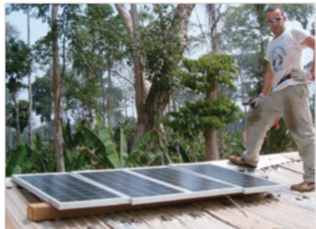
Solar Home System Installation

The prospects for success began to change when a number of start-up energy companies developed solar