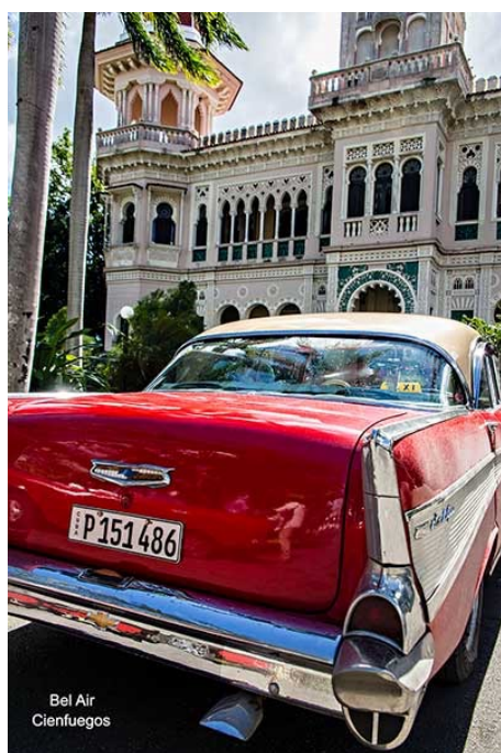
Bel Air Cienfuegos

This beautiful Chevy Bel Air was parked in front of a former casino built by Batista's brother before the revolution. Cars like this often are taxis today but some still are used by individuals.