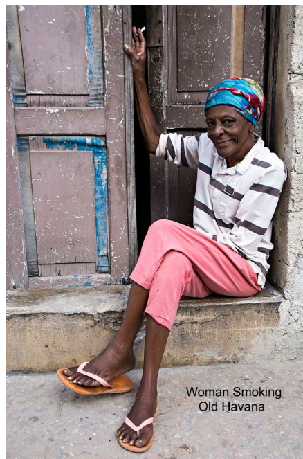
Woman Smoking Old Havana

I try to do something like that, too (without the porters), and wherever I go, I attempt to get a sense of how the culture differs from our own, and capture some of that in my images. Last year we were in Cuba for 10 days, the second time on that island. Cuba is wonderful place for a photographer. People are friendly, it is very colorful, and it has, to a degree, been isolated from the US since the fifties (but not as much as we Americans suppose). There are those old American cars everywhere, of course, charming Old Havana, and the colonial cities of Cienfuegos and Trinidad, with their attractive squares and interesting barrios. There is poverty, and paint and repairs often are needed, but strength, pride, and joy of living are evident, too. I think I was able to capture a portion of that atmosphere. Here are some of those images.