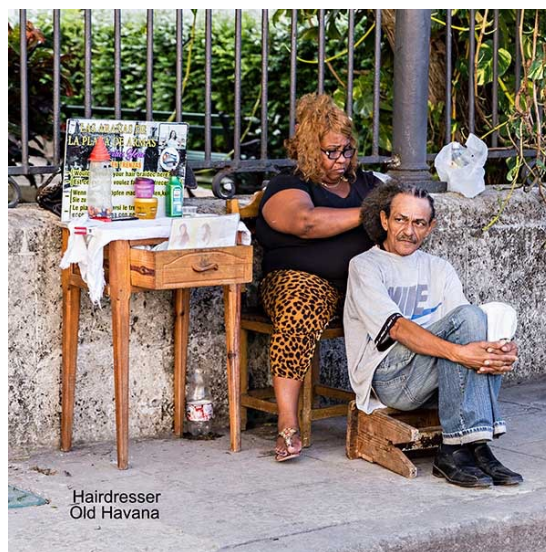
Hairdresser Old Havana

Lots of commerce is done in the open air because weather is good and people cannot afford shop space. This “hairstylist shop” is an example.