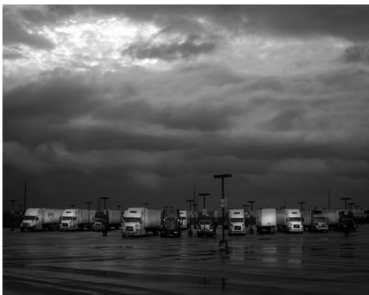
"Circling the Wagons" by Gregg Gillmar