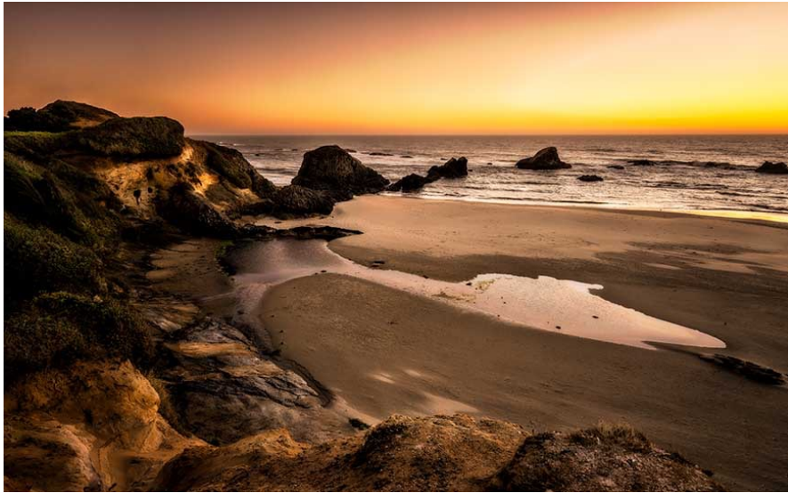
“Rocky Beach at Sunset” by Susannah Kramer