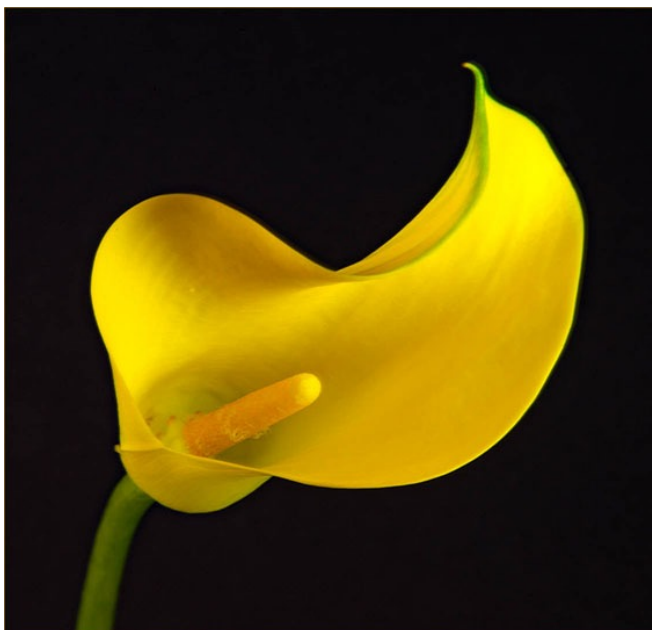
"Mellow Yellow" by Ed Ruckle