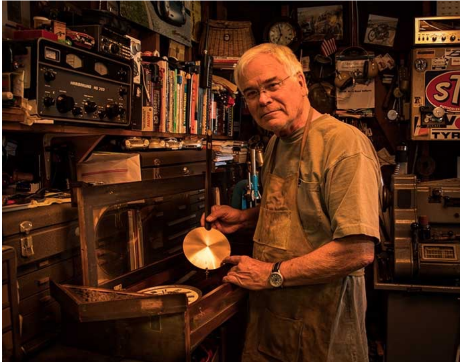
"Clock Repair" by Ed Pinsky