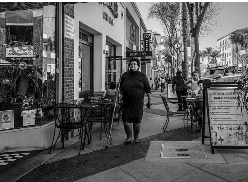
“The Taj”