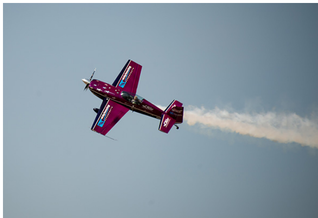
"Up and Away" by Ed Ruckle