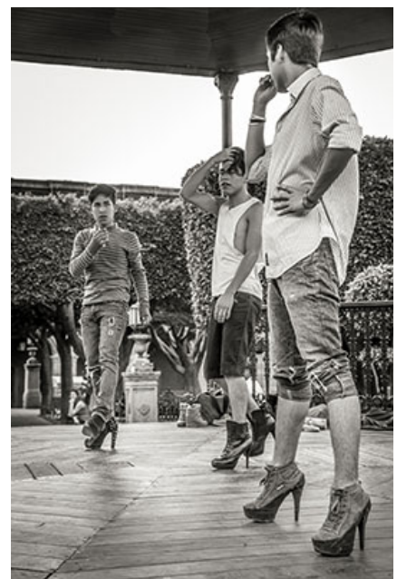
"Political Platforms" by Sal Santangelo