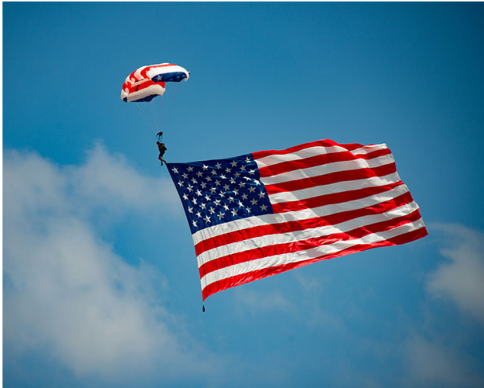
"Old Glory" by Ed Ruckle