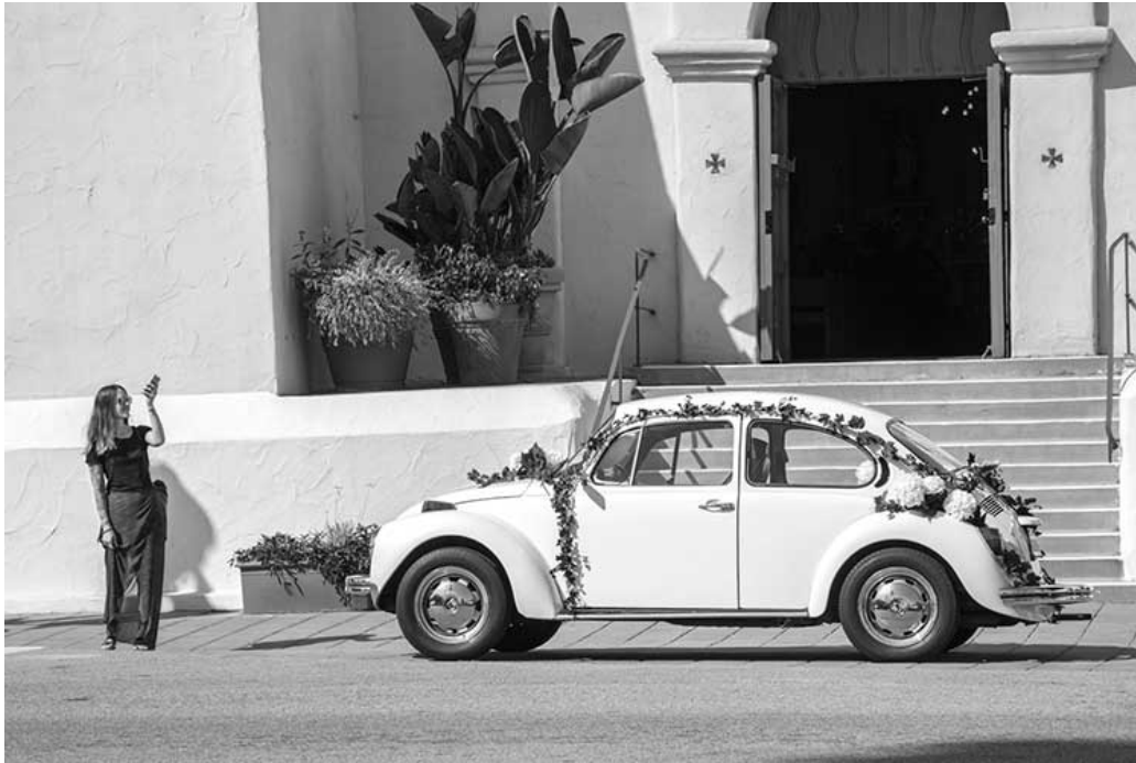
"Wedding Day" by Evan Maidaa