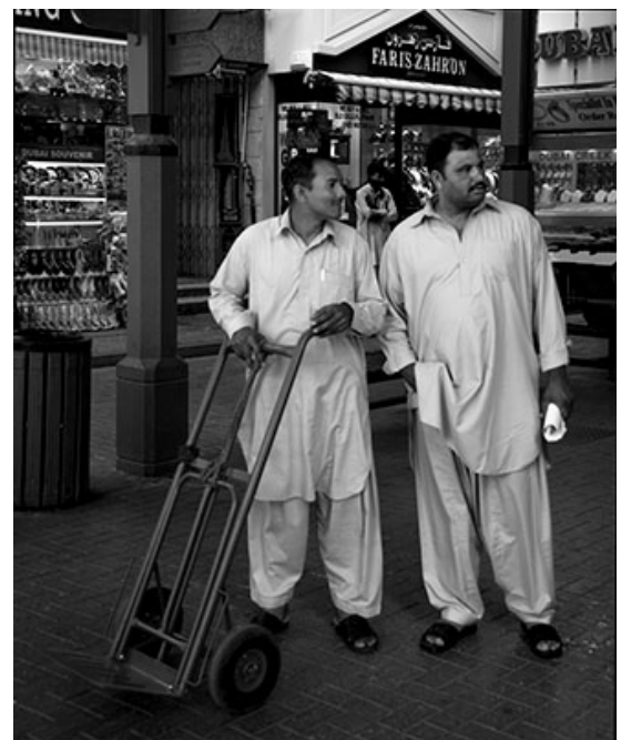
"Girl Watchers" by Bernie Goldstein