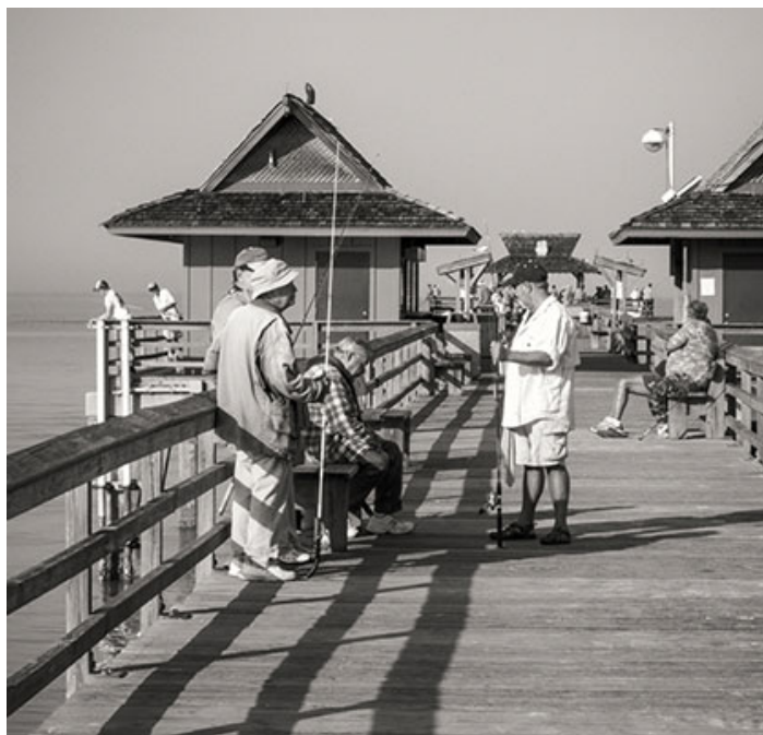
"Fish Stories" by Bruce Schoppe