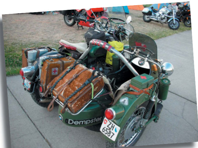
Well appointed old sidecar