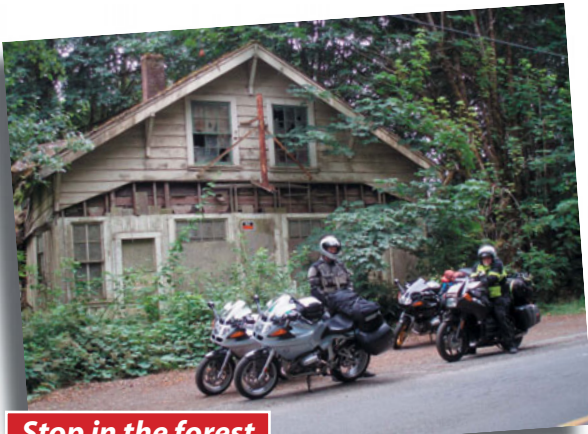
Stop in the forest

So then we spent the next 3 days at the rally, if you've never been to one of these MOA rallies you might consider adding it to your bucket list. It's big! – attendance over the last few years has typically been around 6,000. That means lots of vendors come to set up shop, you can buy just about