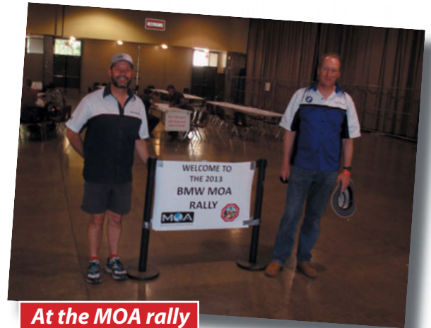
At the MOA rally

after the rally, so we collected all sorts of advice – one common theme was the recommendation of a visit to Crater