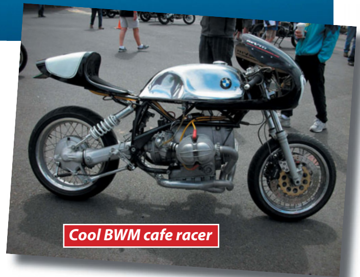
Cool BMW cafe racer

up. There is seasonal tourism as well as a berry picking season when many foreign workers come into town and “camp” on their site in a variety of