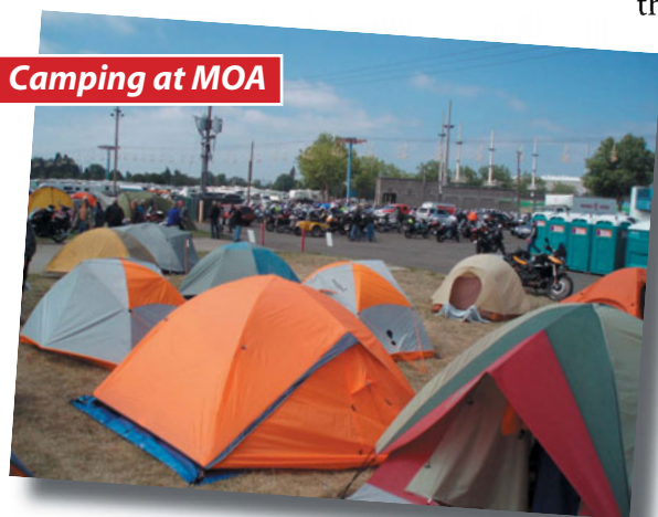
Camping at MOA

Reluctantly we took a short stretch of the interstate to get past Salem, but on a Sunday morning that was not so bad. Then onto the back