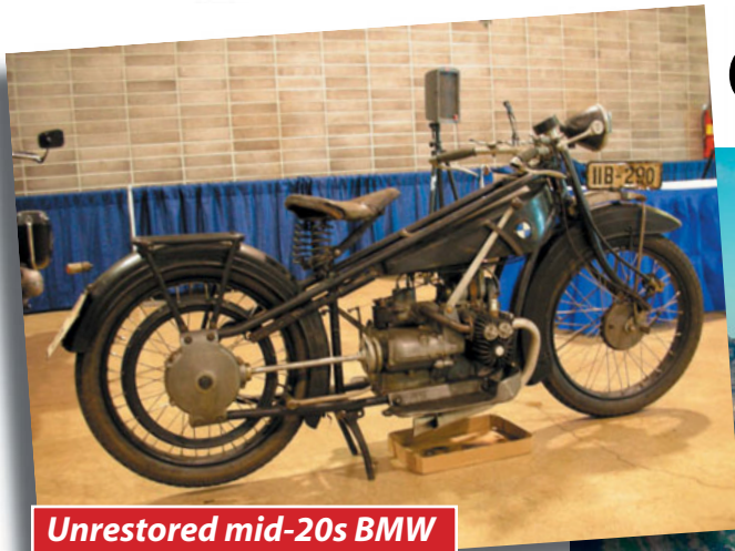
Unrestored mid-20s BMW

roads for a scenic route along Hwy 20 to the National Forest regions, travelling south on Hwy 128, through the volcanic regions and finally via Hwy 58 ending up in a place called Chemult. Very small village, houses, shops, a few motels and gas station strung along the road. We picked the rundown hotel at the end. The price was right and so was the young lady trimming the trees. A young couple had bought the place and was busy doing it