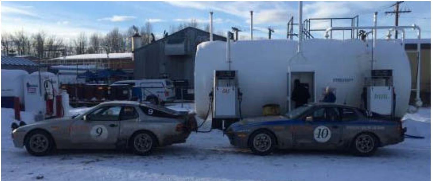
Klaus and Johan fuel up amidst the ice and snow in preparation of the next stage of the rally