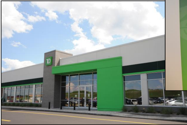
External View of Call Center