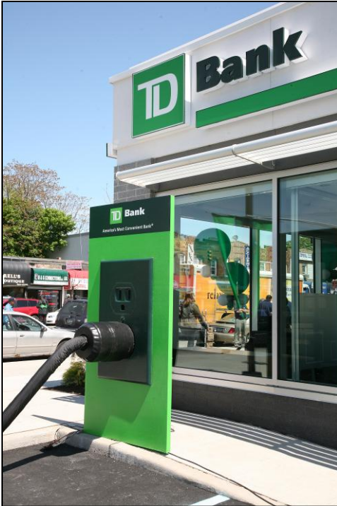
'Pulling the Plug'