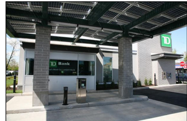
Drive-Thru Solar Canopy