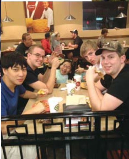
and below are some of the young folks from WGPBC who traveled together to the Florida Fellowship Meeting at MacClenny, FL. They had a most enjoyable time in the Lord. We love and appreciate the dedication of the Lord's young followers.

See WGPBC Annual Meeting Notice page 5 May 23-25