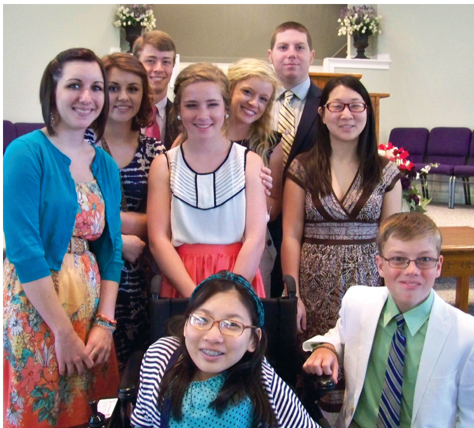
The McCool and Whitehead families joined us for Sunday worship service. The young people at Winter Garden are always happy to be together with these families.

Tapes (subscription or address information): tapes@wintergardenpbc.com