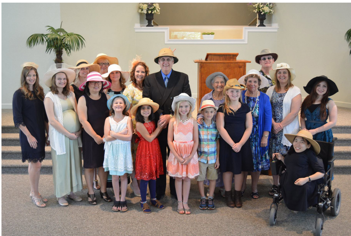
A fun tradition of the ladies (and some gentlemen) of the church is to wear hats on Easter Sunday.