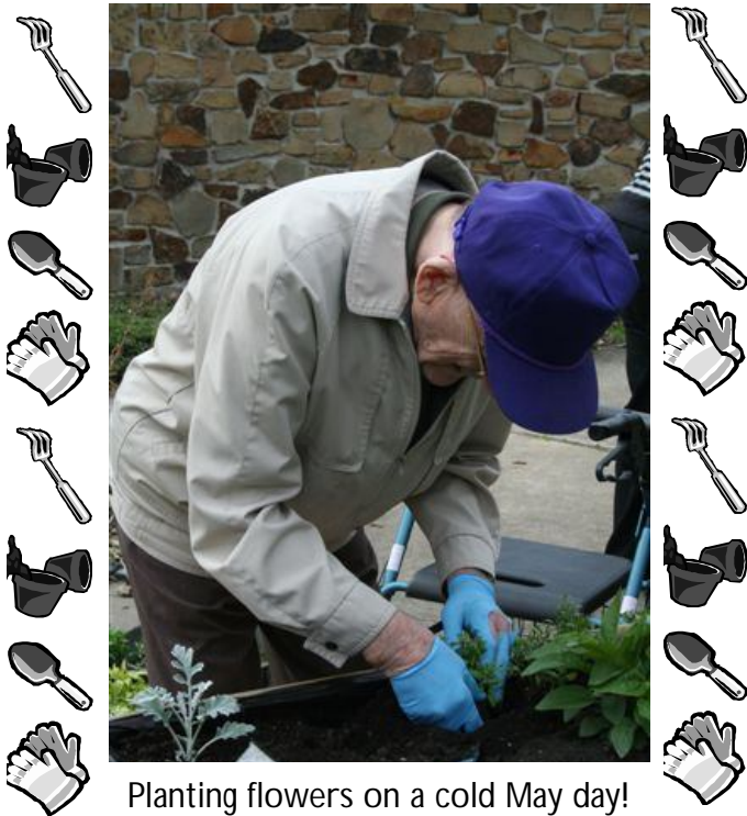
Planting flowers on a cold May day!