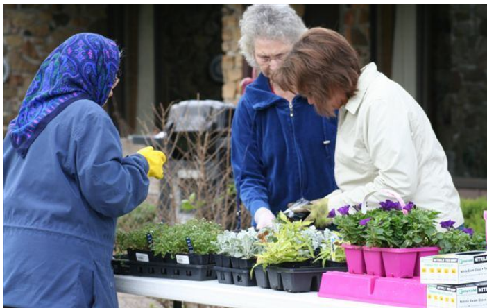
Master Gardeners help residents plant flowers. Never would believe it is the first week of May by the coats.