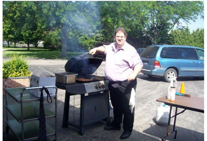
Our own Office Manager does the grilling for the picnic.