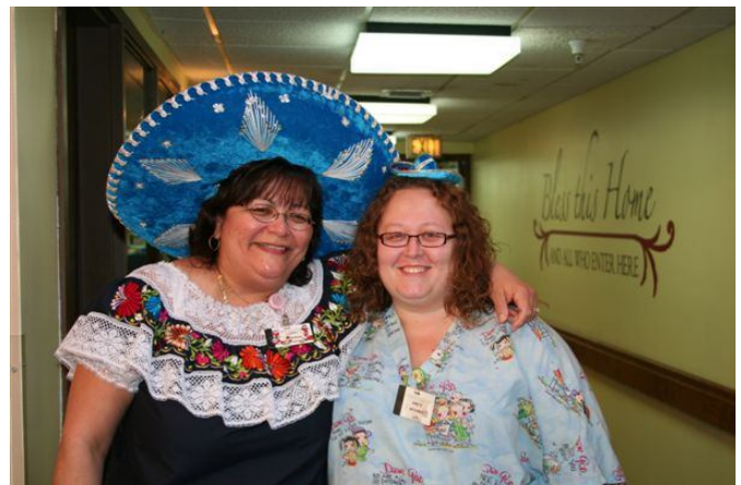
Employees help everyone celebrate Cinco de Mayo.