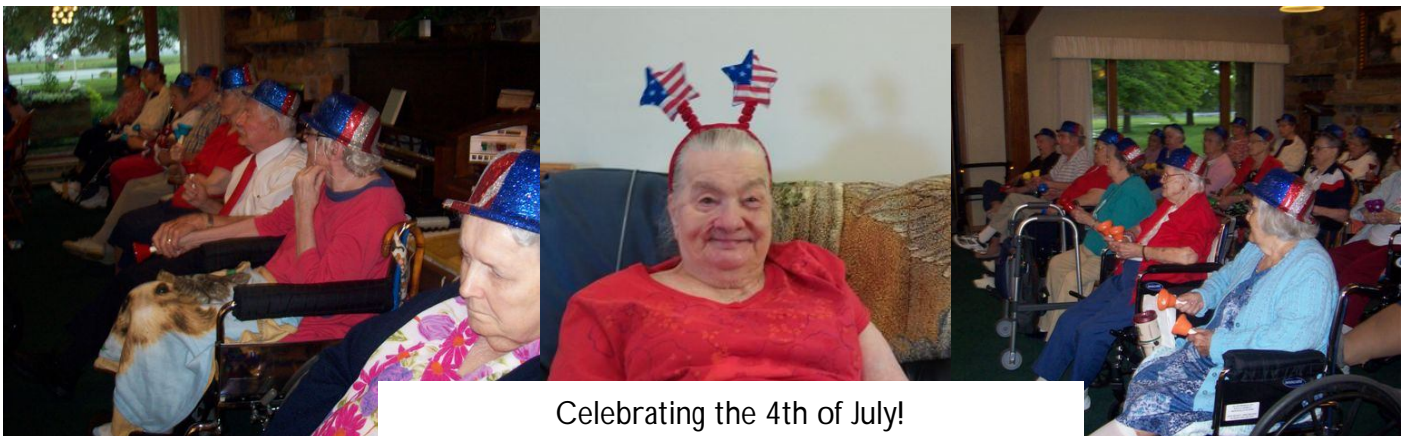
Celebrating the 4th of July!

The Fall Festival is September 16, 17 & 18 . For many years Parkview Haven has taken the residents uptown to watch the booths set up on Friday. On Saturday, is the parade and many of the resi-