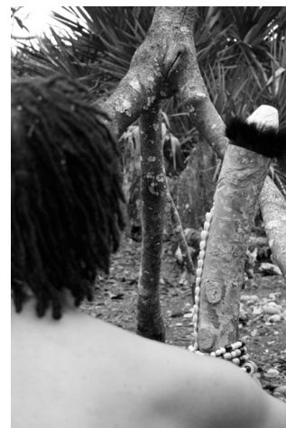
Orisha Ori at Ola Olu Retreat

Ela ro, Ela ro, Ela ro. Ori mo pe o, Ori mo pe o, Ori mo pe o. Ori, I call on you. Ori, I call on you. Ori, I call on you.