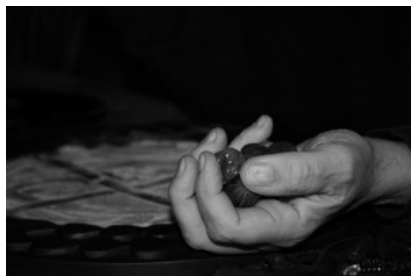
Tapping into the energy of Orunmila.

OGUN: Ogun is the essence of Purpose. This energy allows you to focus, work hard to achieve your goals and find creative solutions to your difficult problems. When you don't seem to have the energy/power to get it done seek out to Ogun.