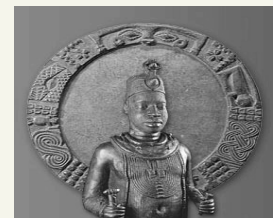
IFA Diving Tray

whose blood flows through my veins. Respect and love to my Ori, the guide to my true Destiny Path. Respect and understanding for the dawn of each day. Respect and understanding to sunset, the end of this journey. As I give my love and respect, give me your blessings along with the love and support in all my endeavors. Ase!