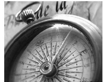
Modern Day Compass

The direction where the sun sets. As the daylight shifts to darkness we need to make changes. Going within, freeing ourselves of the day's energy, only to keep the wisdom and knowledge that was gained.