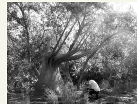
Orisha Ela at Ola Olu Retreat

supremacy. Where the practicality and rewards of good character and long-term thinking replace the destructive focus on instant gratification and self-absorption. Rather than the end, it is the beginning of the next evolutionary imperative.