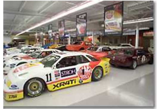
Mercur XR4T Trans Am as raced