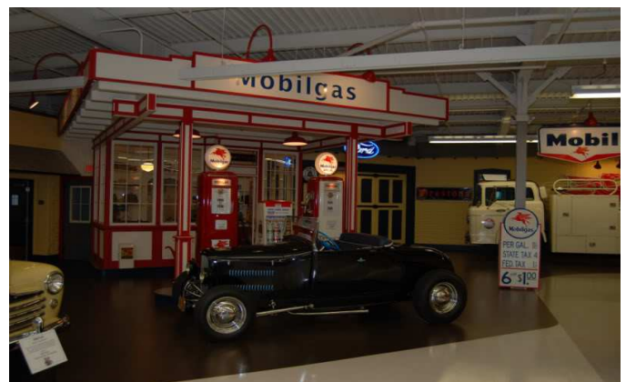
32 Ford at replica Mobil Service Station