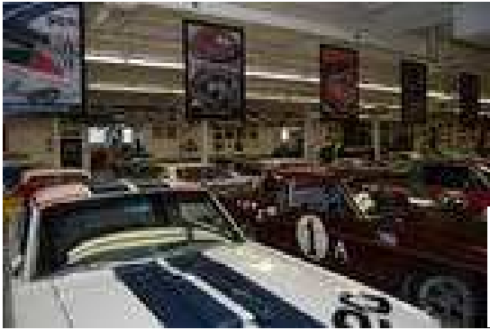
1960's Mustangs backed by the 1980's