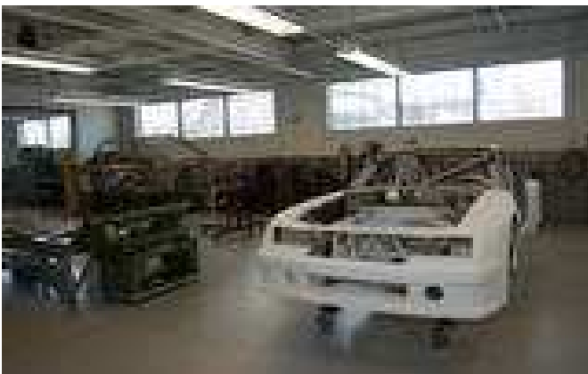
80's Mustang Trans Am under restoration