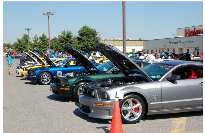
Late Models ready for judging at Holman Ford 2011