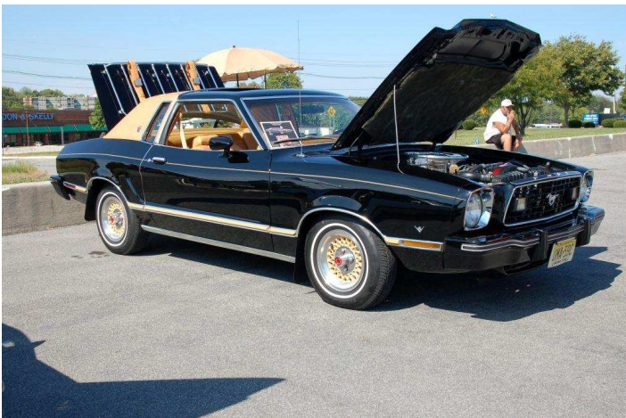
“Best of Show” Award Winner at Holman Ford 2011