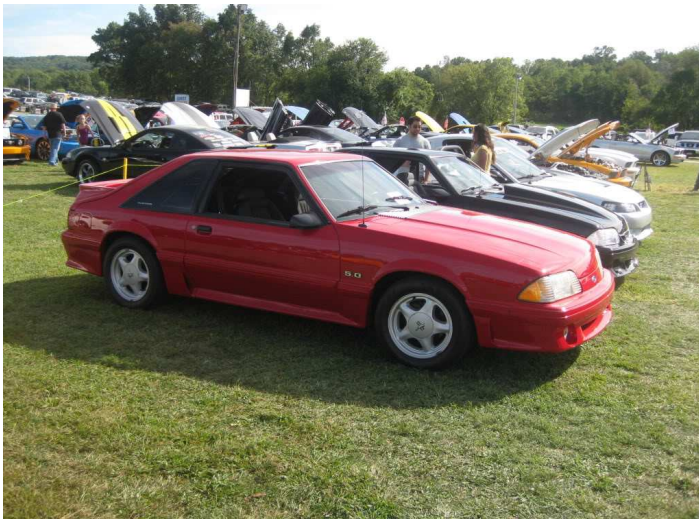
From "Mild to Wild" Fox bodies at American Muscle

In many of the Mustang magazines today you'll see advertisements from American Muscle. In addition to rapidly becoming a major source for all kinds of Mustang accessories, they put on one great show this year. Only in its second year, 524 cars, mostly late model Mustangs, were in competition for awards at the Kimberton Fairgrounds in Pennsylvania. Held on September 11th, American Muscle raised $14,825 to benefit the charity, Homes for Our Troops. In addition to the cars, there were many vendors displaying products, a muffler rapping contest and dyno runs. Members from many local clubs including SJMC, VFMC and Bad Pony Club were in attendance and Cindy Iacocca was there with a 2009 Iacocca Mustang. This is one worthwhile show we all should put on our calendar for next year. Kudos to American Muscle and Everyone that supported this event.