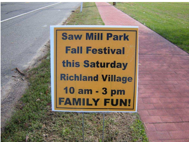
This Sign says it all!