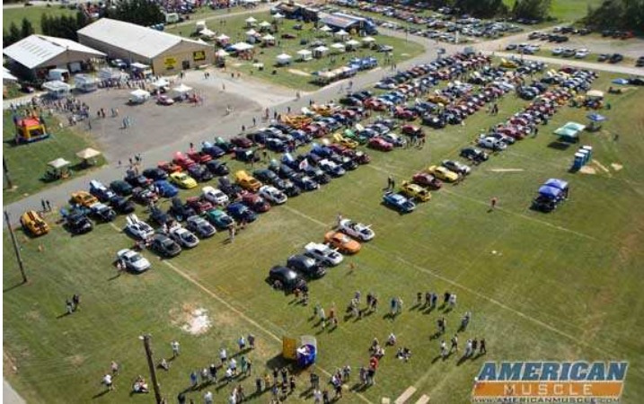
American Muscle Show from a Helicopter

In many of the Mustang magazines today you'll see advertisements from American Muscle. In addition to rapidly becoming a major source for all kinds of Mustang accessories, they put on one great show this year. Only in its second year, 524 cars, mostly late model Mustangs, were in competition for awards at the Kimberton Fairgrounds in Pennsylvania. Held on September 11th, American Muscle raised $14,825 to benefit the charity, Homes for Our Troops. In addition to the cars, there were many vendors displaying products, a muffler rapping contest and dyno runs. Members from many local clubs including SJMC, VFMC and Bad Pony Club were in attendance and Cindy Iacocca was there with a 2009 Iacocca Mustang. This is one worthwhile show we all should put on our calendar for next year. Kudos to American Muscle and Everyone that supported this event.