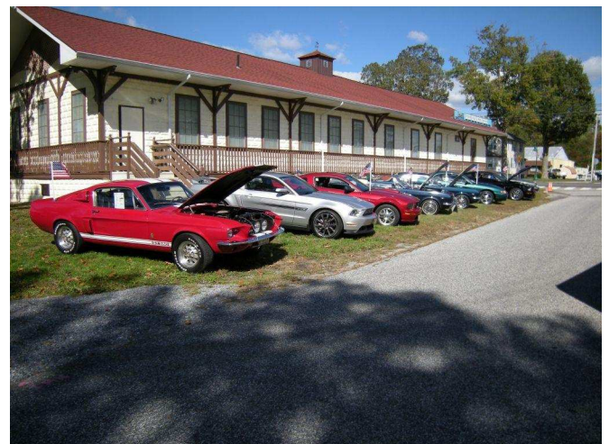
SJMC outside the Patcong Valley Clubhouse