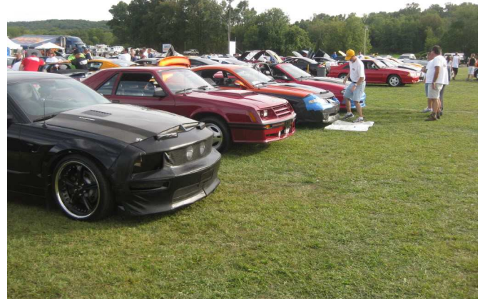
Variety of years at American Muscle