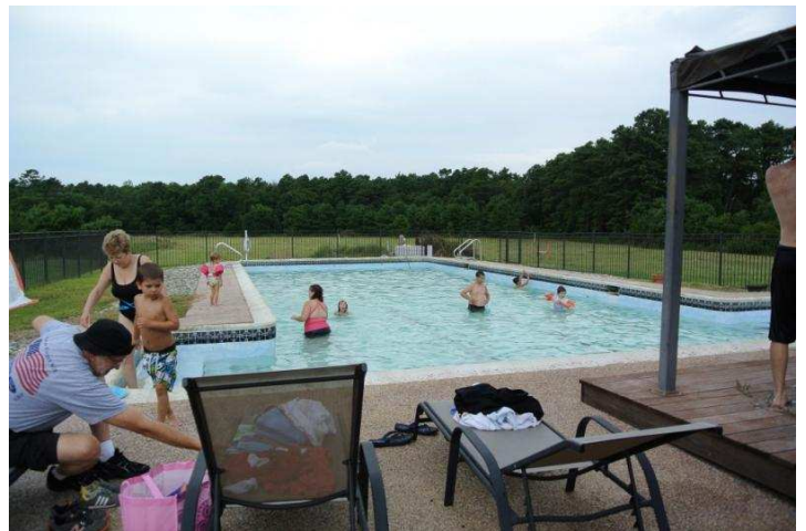
The Pool was very inviting