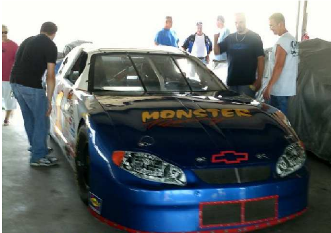
Checking out a Monster Mile Stockcar