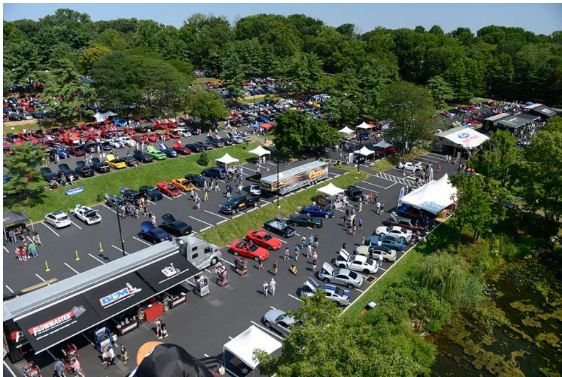
Overhead shot of a portion of the show

Sunday, August 11th all the parking lots of Delaware County College in nearby Media PA were turned into what is billed as “the largest single day Mustang Show” as American Muscle returned there for their 5th annual show. Close to 1500 Mustangs were on display and countless more littered the overflow and spectator lots. This year’s celebrity guests included Chip Foose famous designer and TV host of “Overhaulin’” and World Drifting Champion Vaughn Gitten Jr. Both signed autographs for hours before checking out the showfield and making their choices for awards. Also wandering the event were the American Muscle Girls selling tickets and posing for pictures.