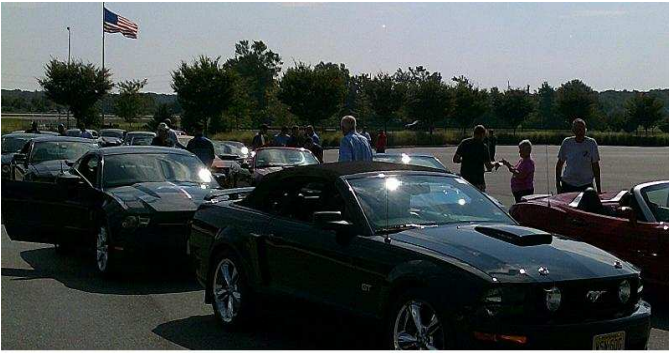
Getting Ready for the Drive to Dover