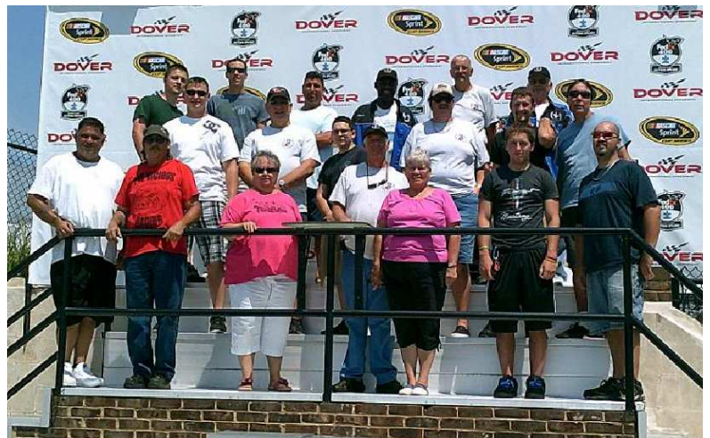
The SJMC in "Victory Lane"