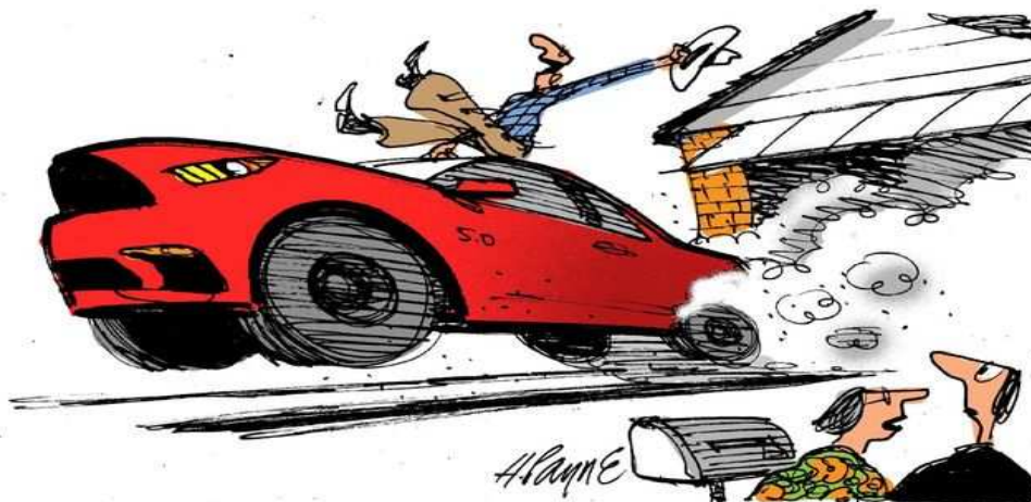
"Our new Mustang."

Needless to say, owning a Mustang presents you many options from cruising short or long distances to competing or whatever you want to do, but in any case we know that owning a Mustang is fun.