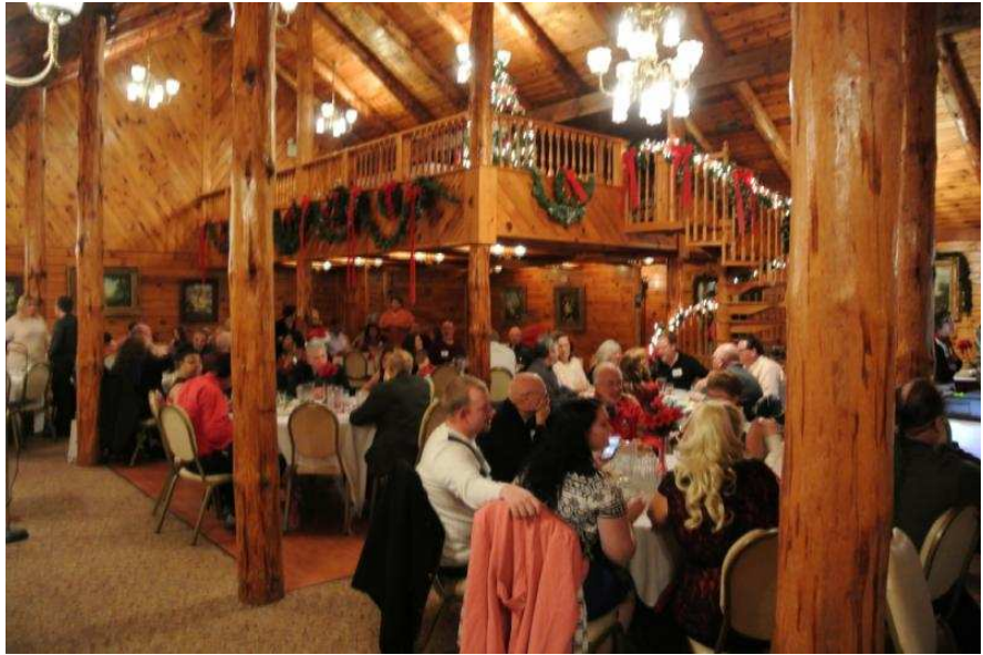
The Red Pine Inn was very festive!

In closing, I have knowledge from good sources that we will be going back to Masso's Red Pine Inn this year 2015. Personally I can't wait to see every one throughout the Car Show season and at the Christmas Party!