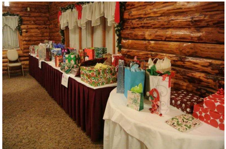
The Grinch tables were full of gifts!