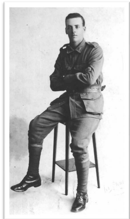
Bruce Wilkins Campbell 1916