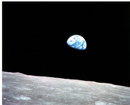
Photo 1 Earthrise Apollo 8, 1968

The Apollo 8 astronauts were the first humans to escape the gravity of Earth. As they orbited the moon, they turned their cameras back toward Earth and took the most beautiful and important selfie ever. 1 By showing Earth against the blackness of the cosmic void, Apollo 8 provided the human species with its first view of its true existential condition, namely that we inhabit a tiny planet floating alone in a massive universe.