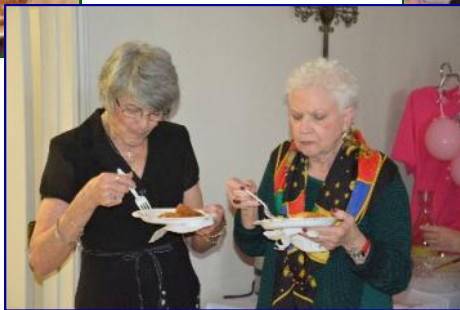
January 26 Social