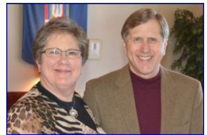
Sister and Brother