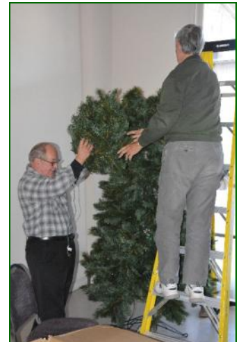
Taking Down of the Greens after Epiphany 1/7/14