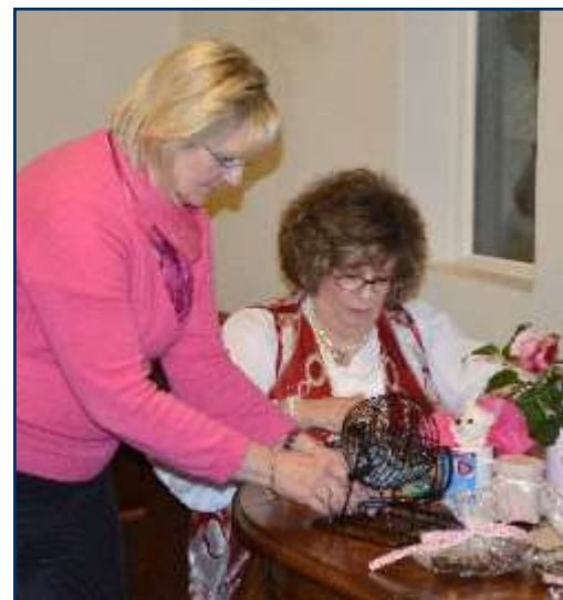
Our (almost pro) Bingo Callers