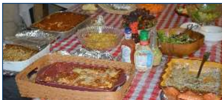
Maybe it wasn't the BINGO!