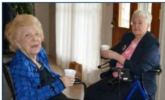
Even if its just Coffee