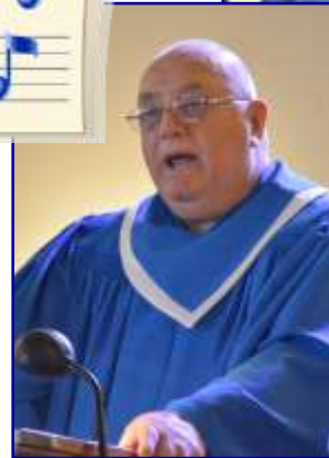
“Peace in the Valley” Rip VanWinkle