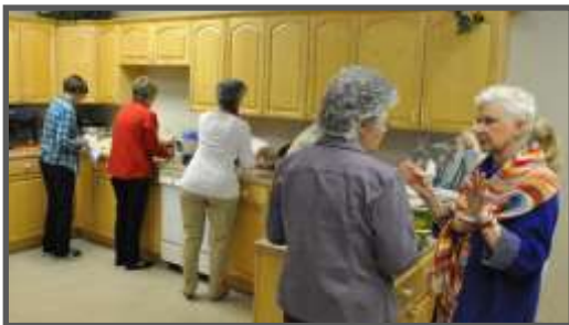
Work behind the scenes