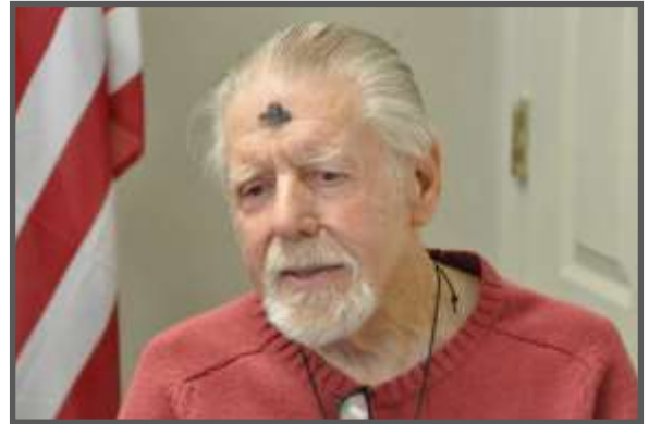
A short Service

Ash Wednesday, is the first day of Lent and occurs 46 days before Easter. It is a moveable fast, falling on a different date each year because it is dependent on the date of Easter. It can occur as early as February 4 or as late as March 10.