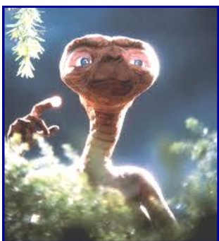
The Other ET

Matthew 19:26 NIV "Jesus looked at them and said, 'With man this is impossible, but with God all things are possible'."