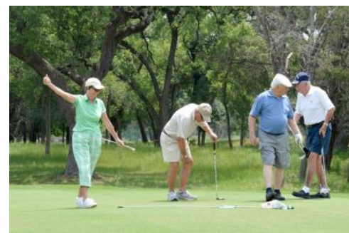
We Made one!