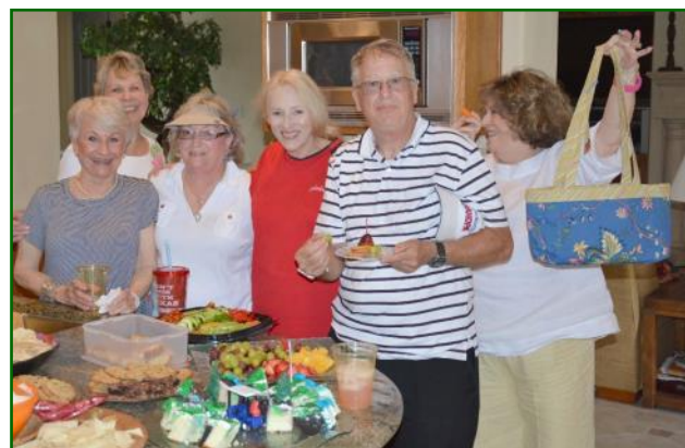
Post Golf Party at Staples (See Website for more pictures)