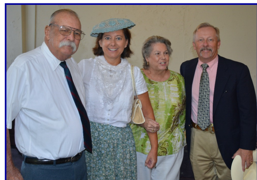
Extra invited guests, family, and visitors.